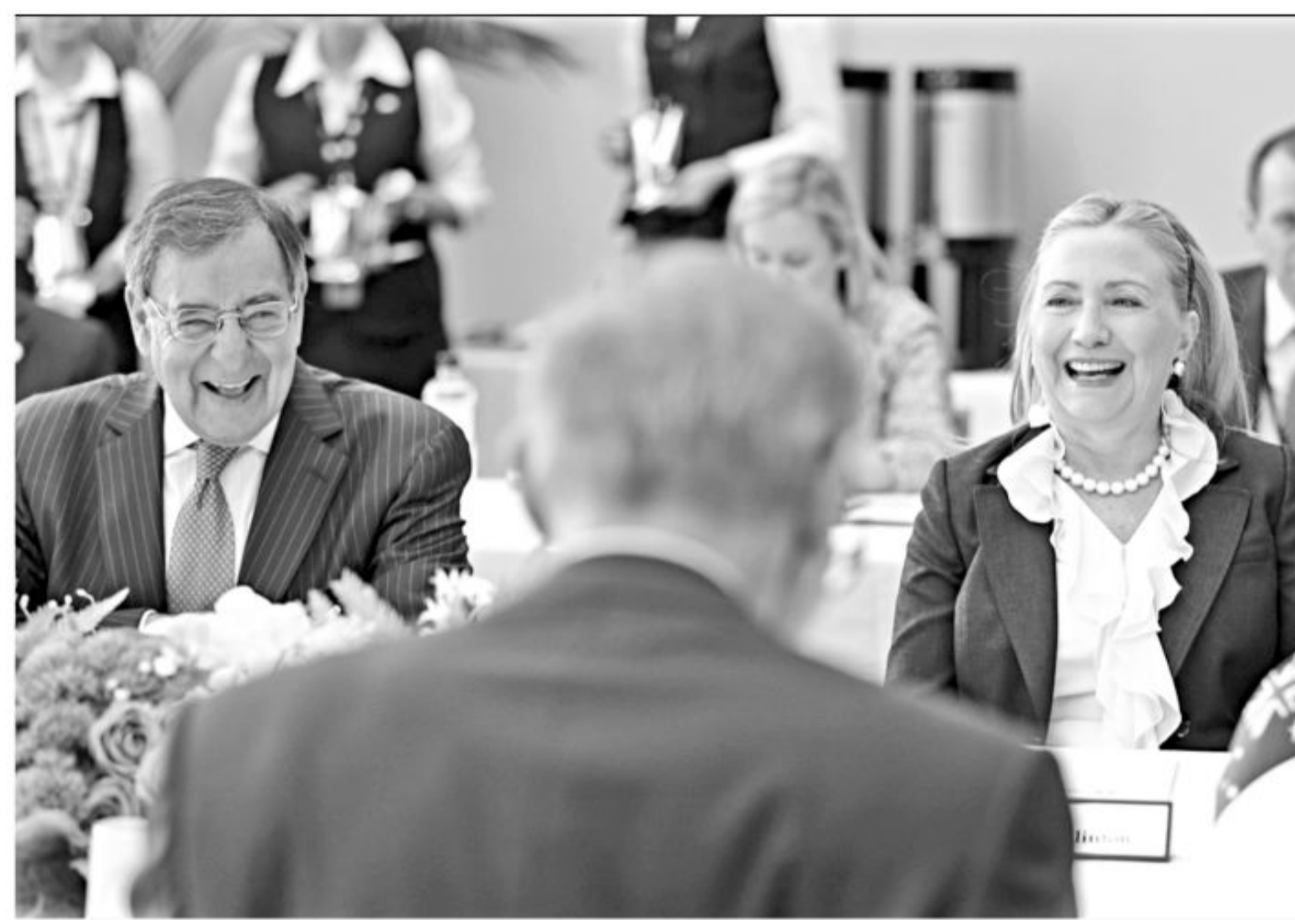
US Defence Secretary Leon Panetta, left, Australian Foreign Minister Bob Carr, back to camera, and US Secretary of State Hillary Clinton, right, share a light moment during the annual Australia-US Ministerial Consultations in Perth, Australia yesterday. Referring to India as the world's largest democracy and a dynamic emerging economy, Hillary urged more cooperation between Australia and India and hoped for joint naval vessel exercises.