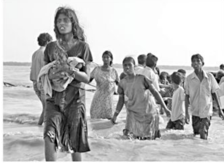
Sri Lankans fleeing for safety during the civil war in 2009.