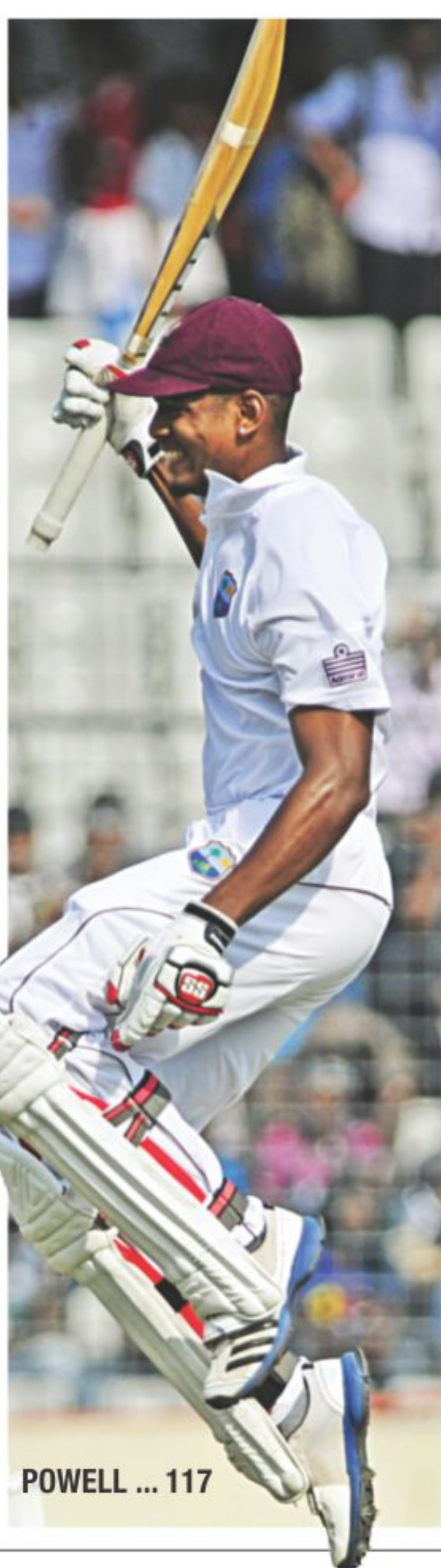
POWELL ... 117