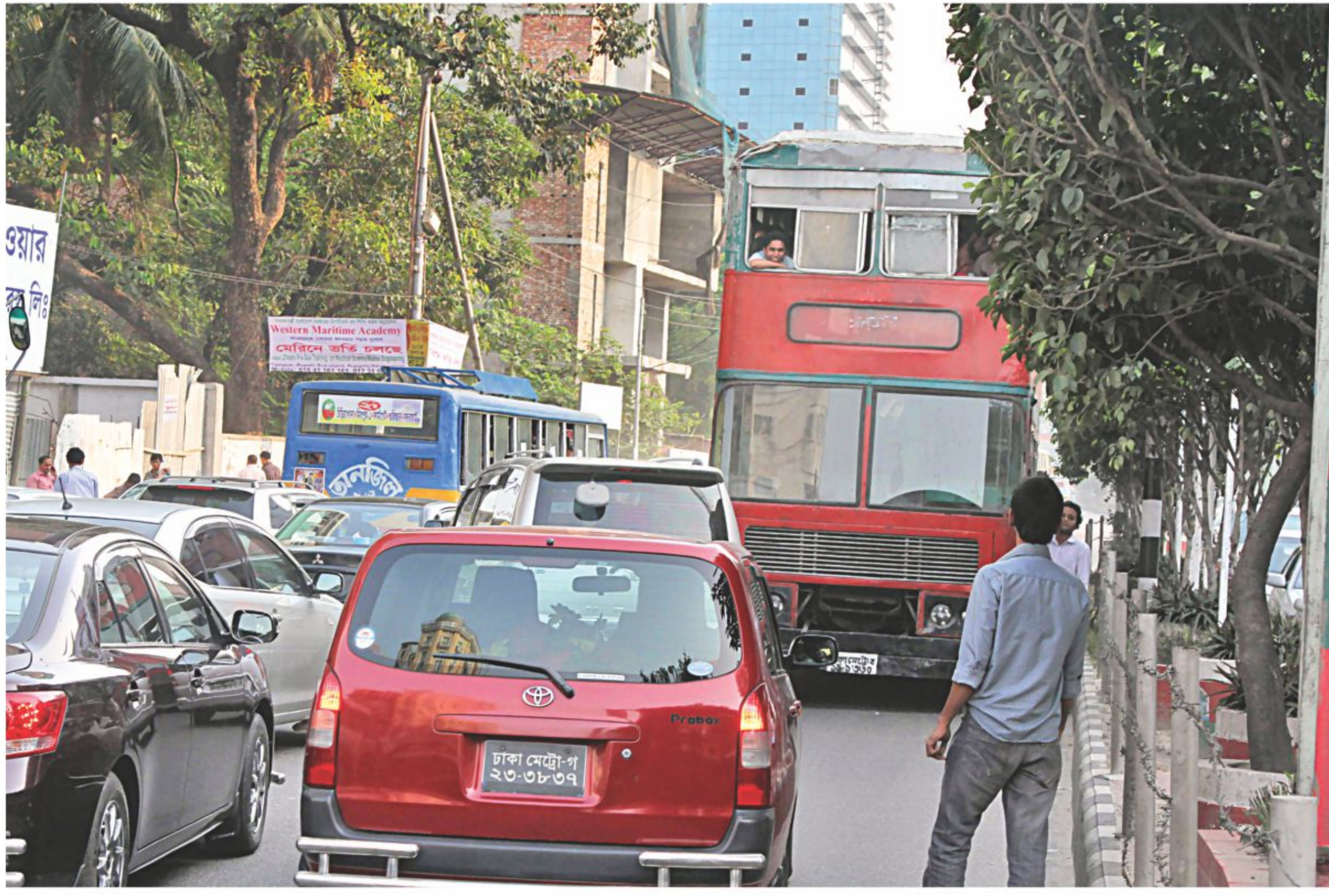
A double-decker carrying students and another single-decker behind it, not visible, travel on the fast lane in the wrong direction on Kazi Nazrul Islam Avenue yesterday afternoon creating chaos on the already congested thoroughfare of the capital. A few students were signalling oncoming traffic to move out of the way.