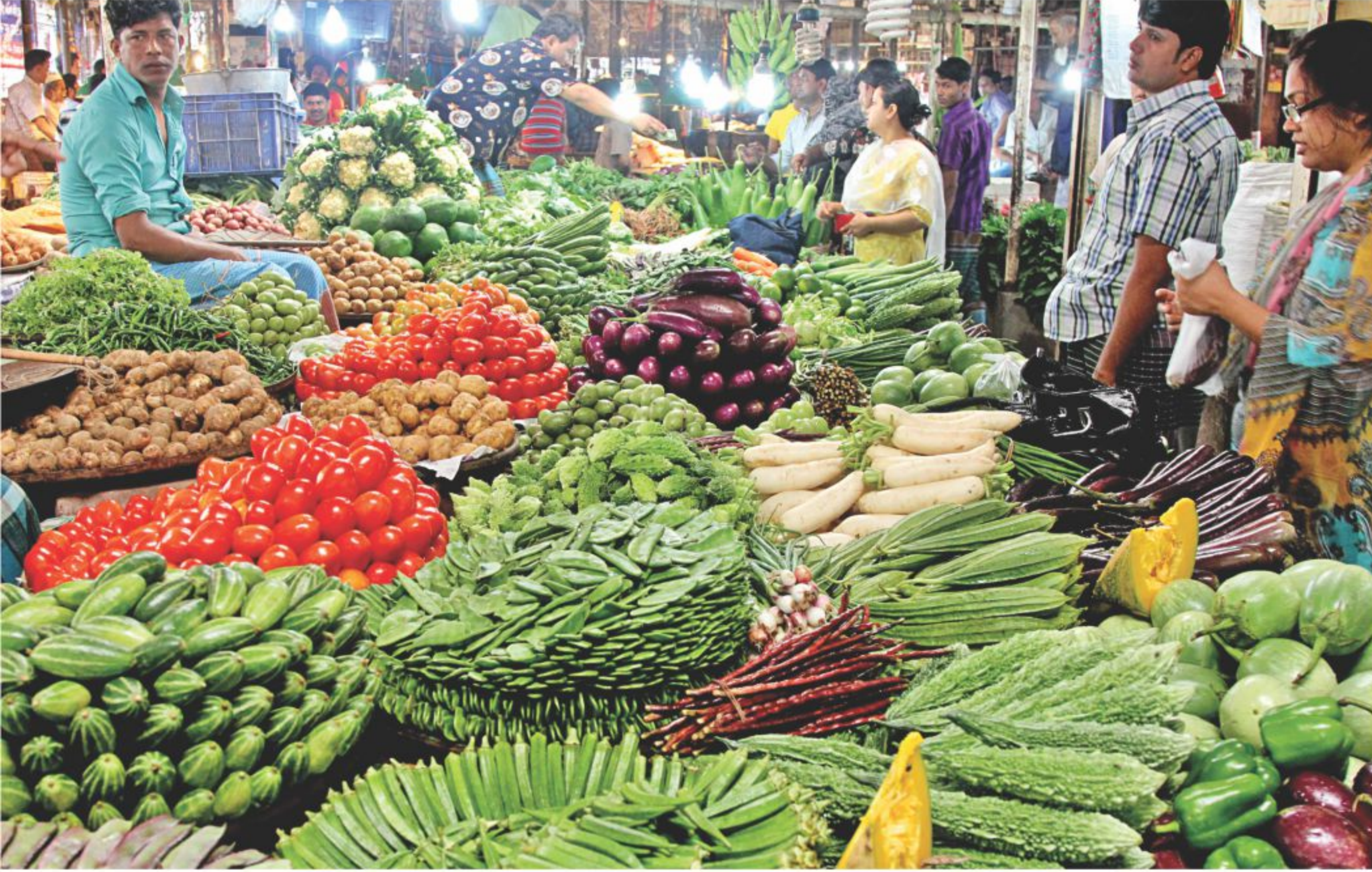
Malibagh Bazar, which recently declared that it is free from adulterated vegetables, has seen a sharp rise in customers with an eye for fresh vegetables. There are several signs in the market letting people know that it is free from formalin, a preservative. Several other kitchen markets in the capital also followed this move and started checking vegetables for formalin.