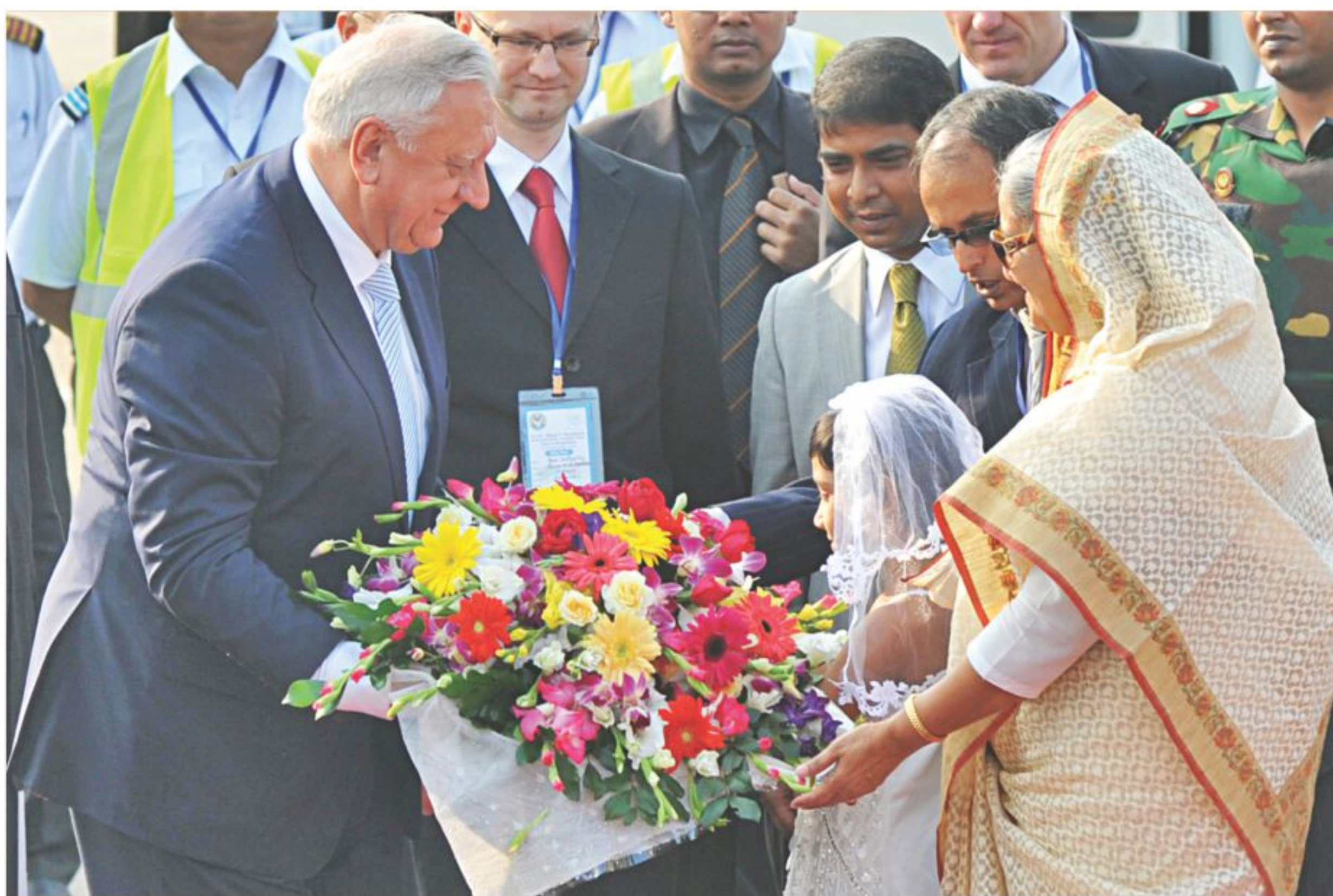
A child presents Belarus Prime Minister Mikhail Myasnikovich flowers as Bangladesh premier Sheikh Hasina receives him at Shahjalal International Airport yesterday afternoon.