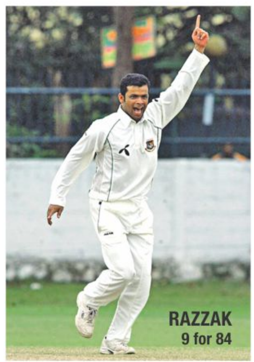
RAZZAK 9 for 84

track and there was nothing on the pitch for the spinners. I always try to give my hundred percent no matter where I'm playing and that's the reason I'm also not thinking about