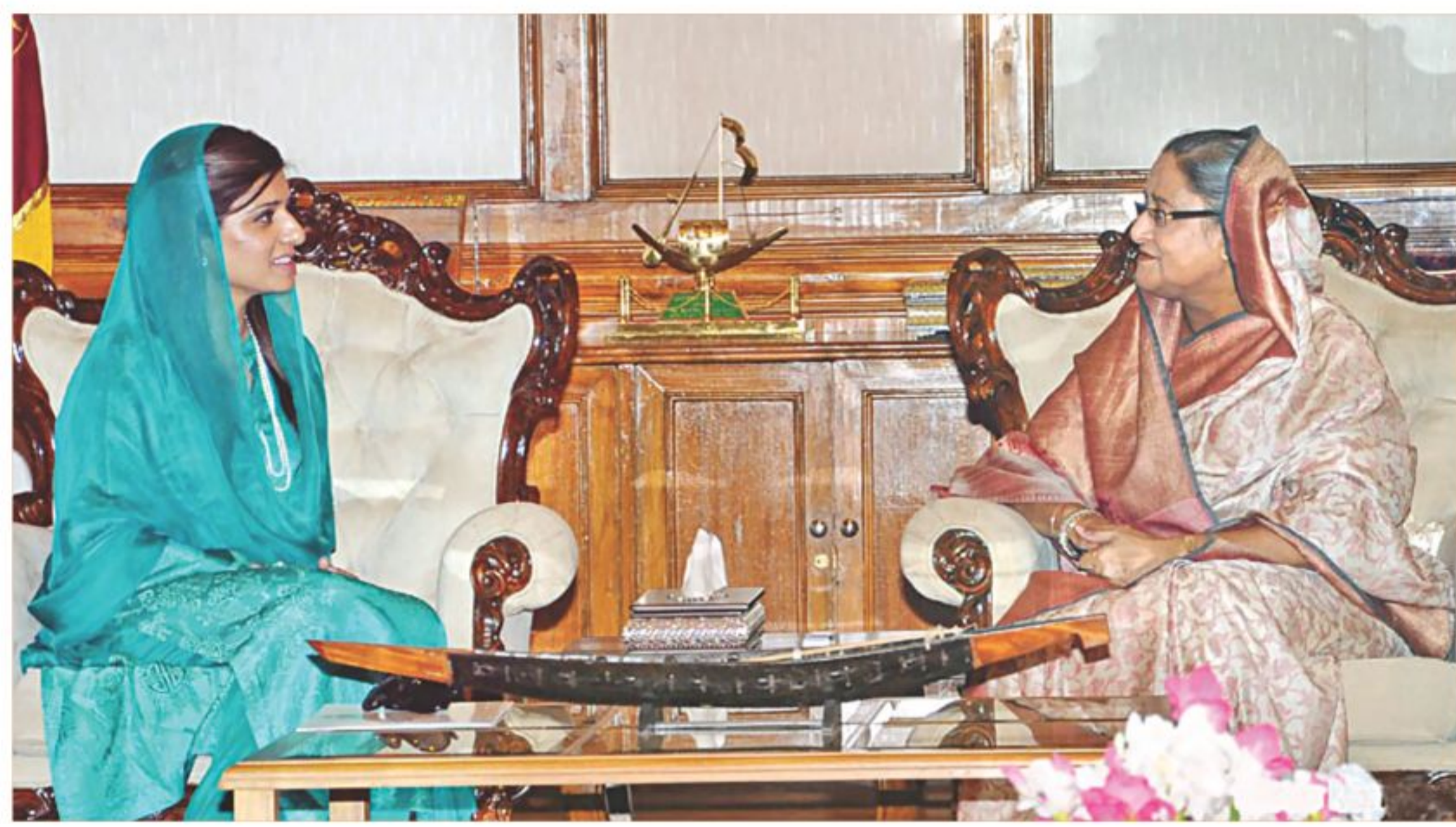
Pakistan Foreign Minister Hina Rabbani Khar calls on Prime Minister Sheikh Hasina at Gono Bhaban yesterday to deliver the Pakistan president's invitation to Hasina for the upcoming D-8 summit in Islamabad.

during the Liberation War in 1971. This will be Sheikh Hasina's first visit to Pakistan since she returned to power in 2009. She will leave on November 21 and return home on November 23 after taking part in the eighth D-8 summit. She last visited Pakistan in 1998 in her first term as prime minister. Press Secretary to the Prime Minister