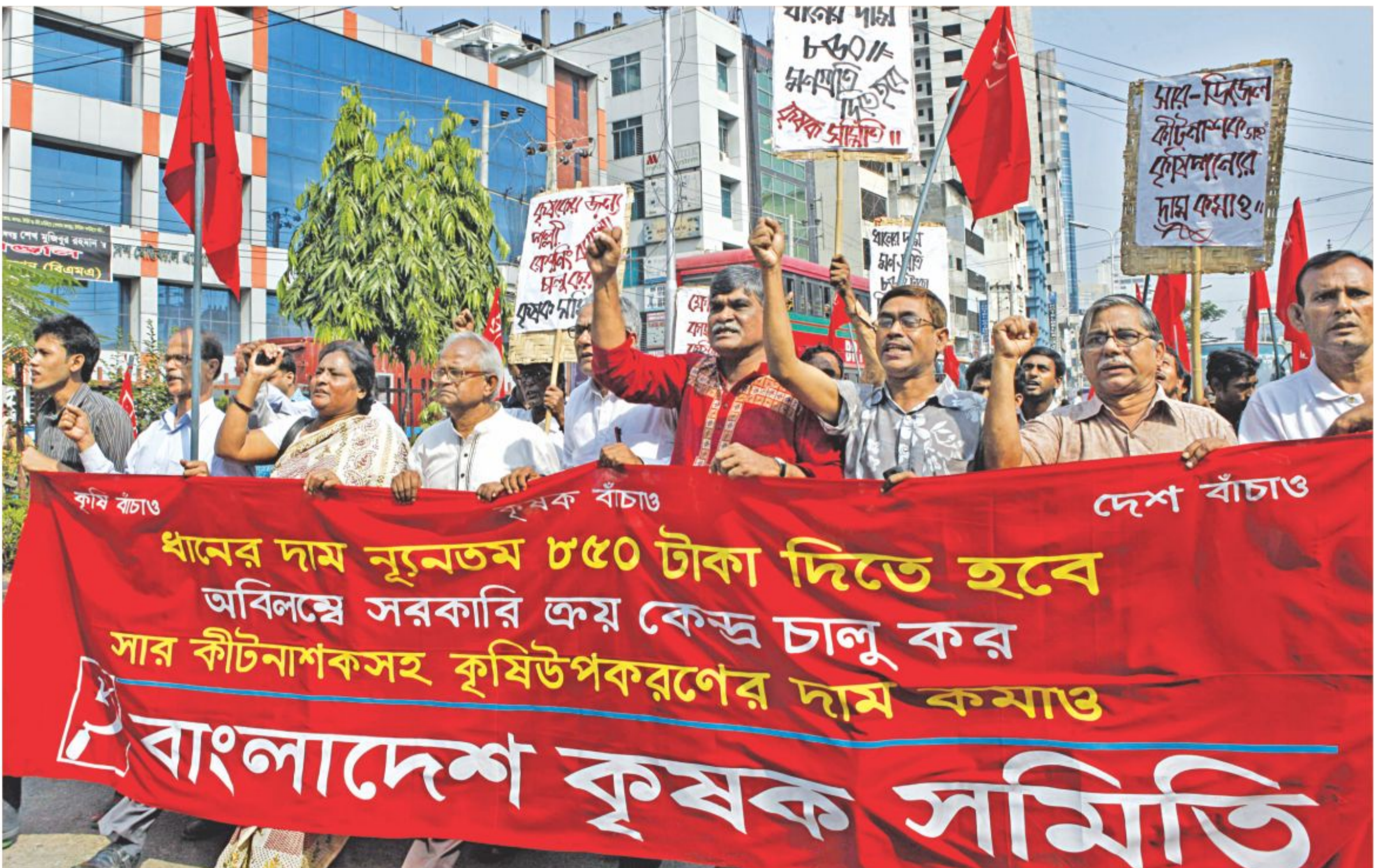
Bangladesh Krishak Samity brings out a procession in front of Jatiya Press Club in the capital yesterday demanding price hike of paddy, introduction of state-run crop purchase centres, and decrease in pesticide and fertiliser prices.