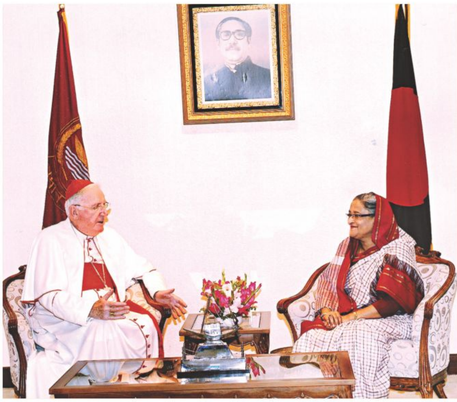
Cardinal Cormac Murphy O'Connor, Archbishop Emeritus of Westminster and special envoy of Pope Benedict XVI, calls on Prime Minister Sheikh Hasina at her office yesterday.

Religious fanatics on September 29-30 vandalised many houses, temples of Buddhist people and set them ablaze, triggering huge criticism across the country.