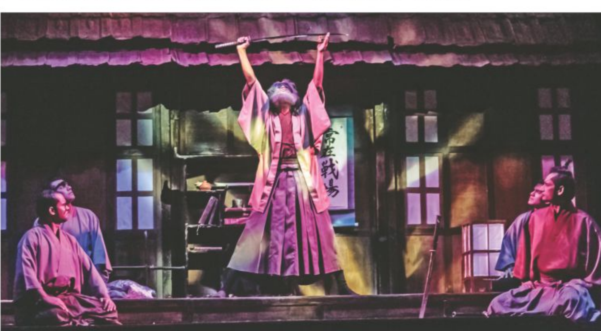
The play is a collaborative work between Bangladesh Shilpakala Academy and Japanese Embassy.