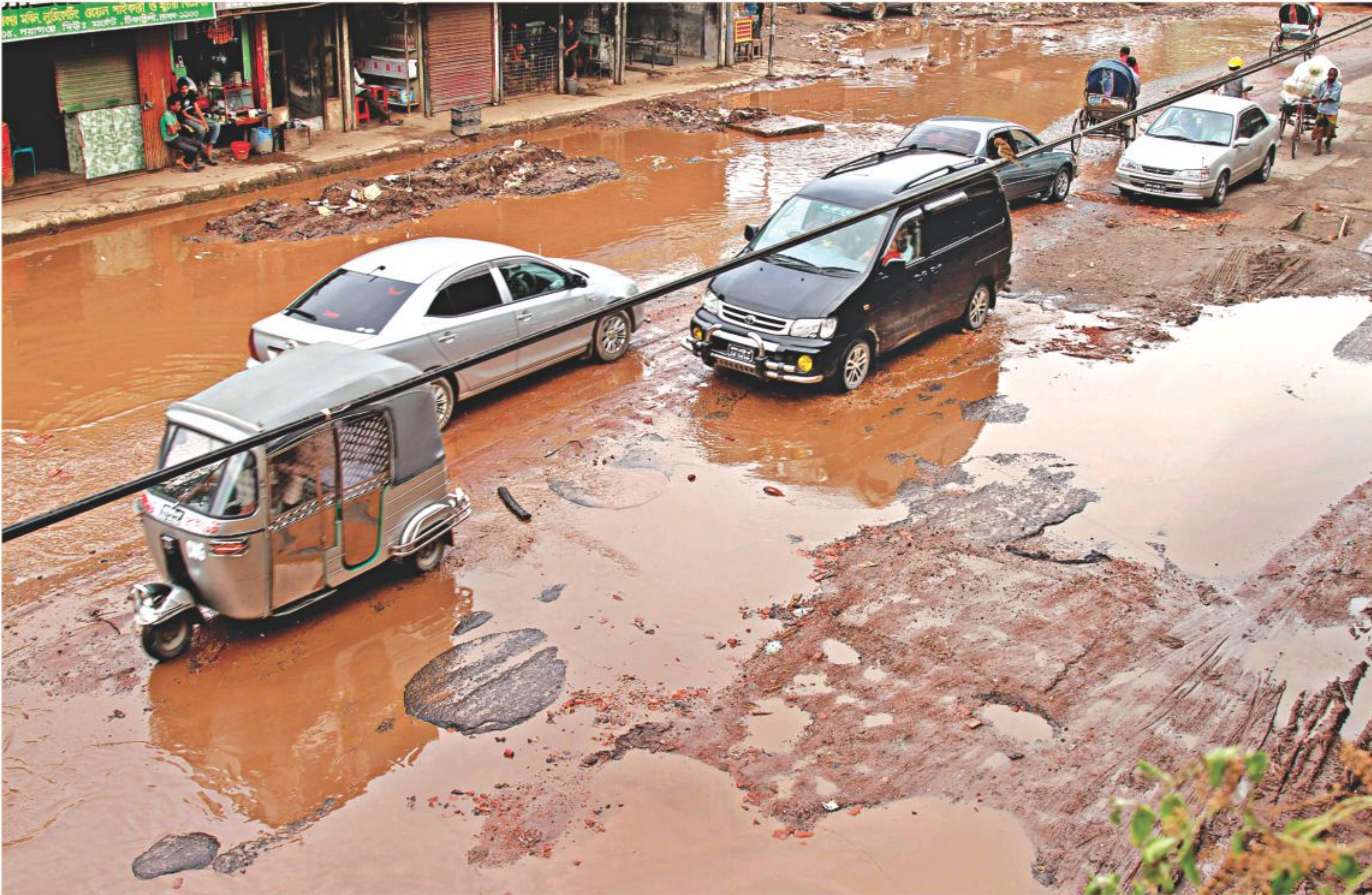
Travelling over Dayaganj Road of the capital became a hassle after rain for the last couple of days left muddy puddles all over the pothole-riddled road. The photo was taken on Tuesday.