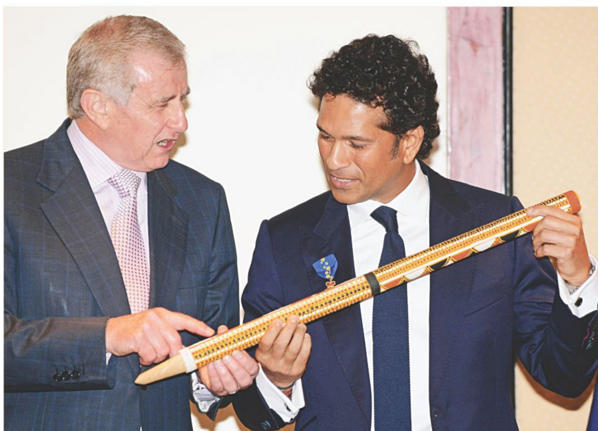
Australian Arts Minister Simon Crean (L) points out the fine craftsmanship of a commemorative stump decorated by an aboriginal artist after presenting the membership of the Order of Australia to Indian cricket legend Sachin Tendulkar in Mumbai yesterday.