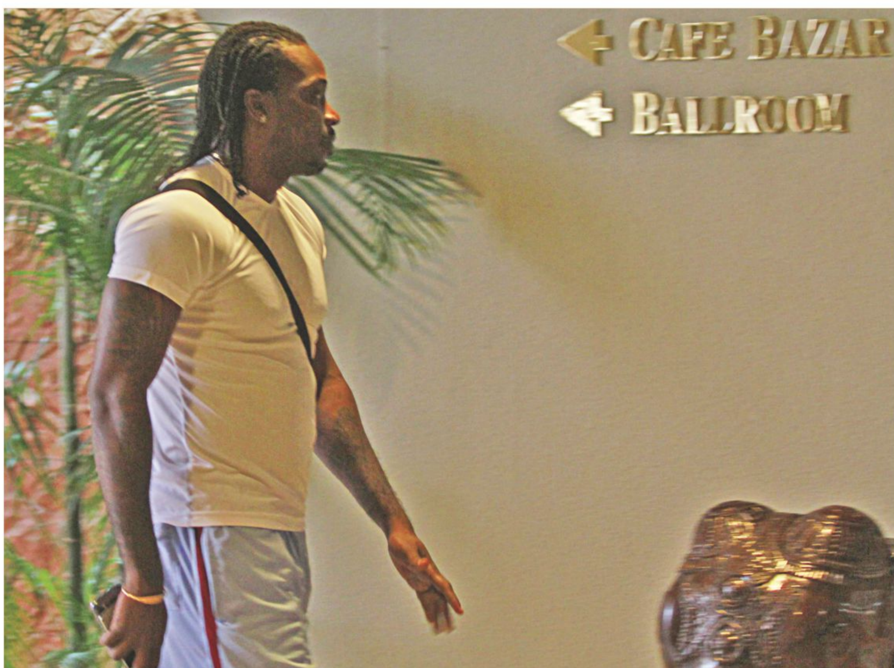
West Indies batsman Chris Gayle strolls inside the Sonargaon Hotel yesterday.