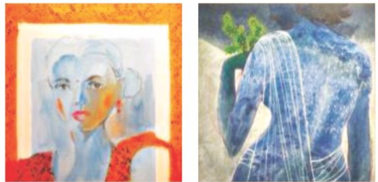
1904 in which the famed artist almost exclusively created compositions dominated by shades of blue.

Each artist will exhibit paintings inspired by Pablo Picasso's "Blue Period", a period from 1901