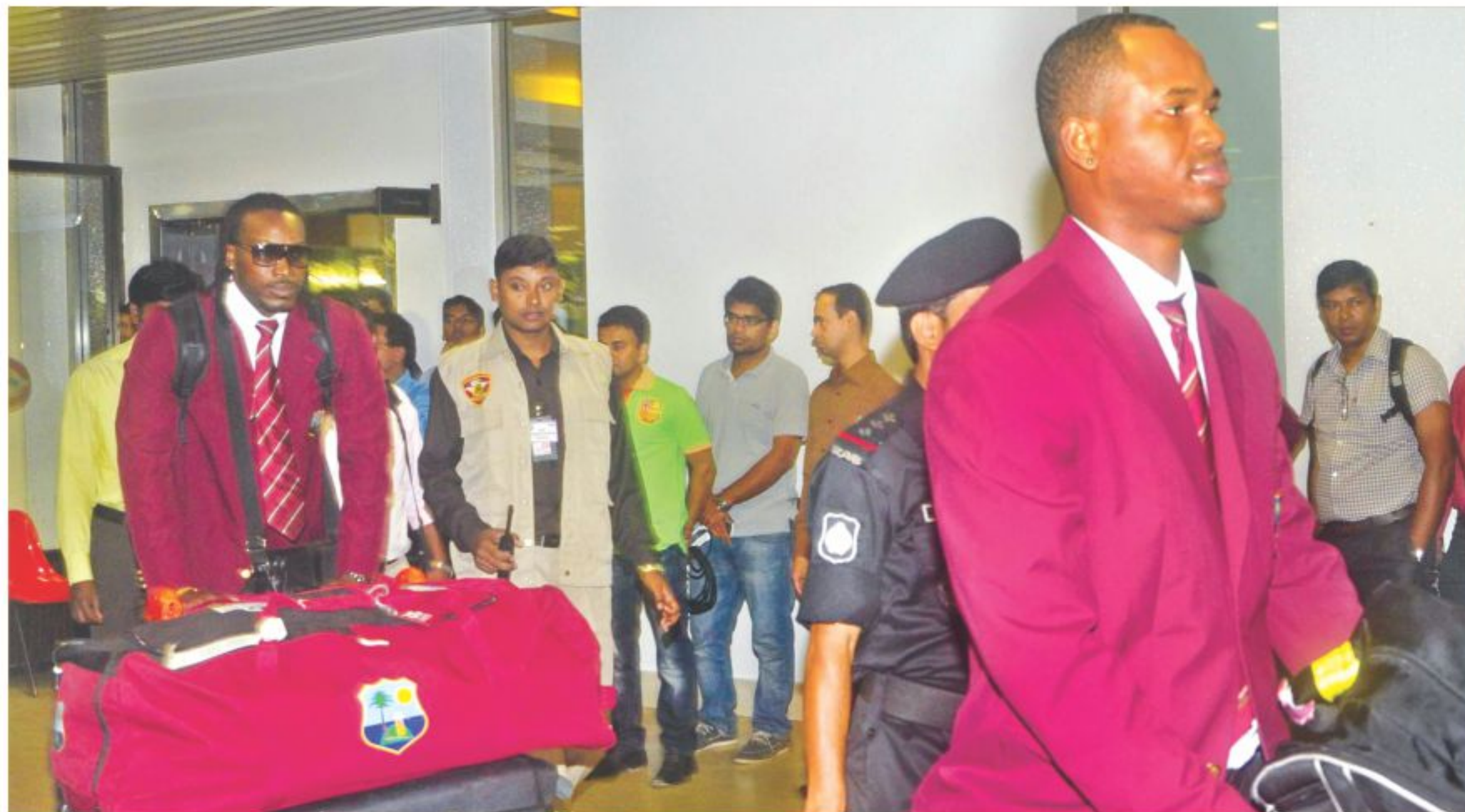
(L) West Indies skipper Darren Sammy gives thumbs up (right) while two of the stars of his side Marlon Samuels (above, R) and Chris Gayle pass through the lobby at the Hazrat Shahjalal International Airport yesterday morning. The World T20 champions came here to play two Tests, five ODIs and a T20I against the hosts.

They are scheduled to begin the tour with a three-day warm-up game at the BKSP against a strong