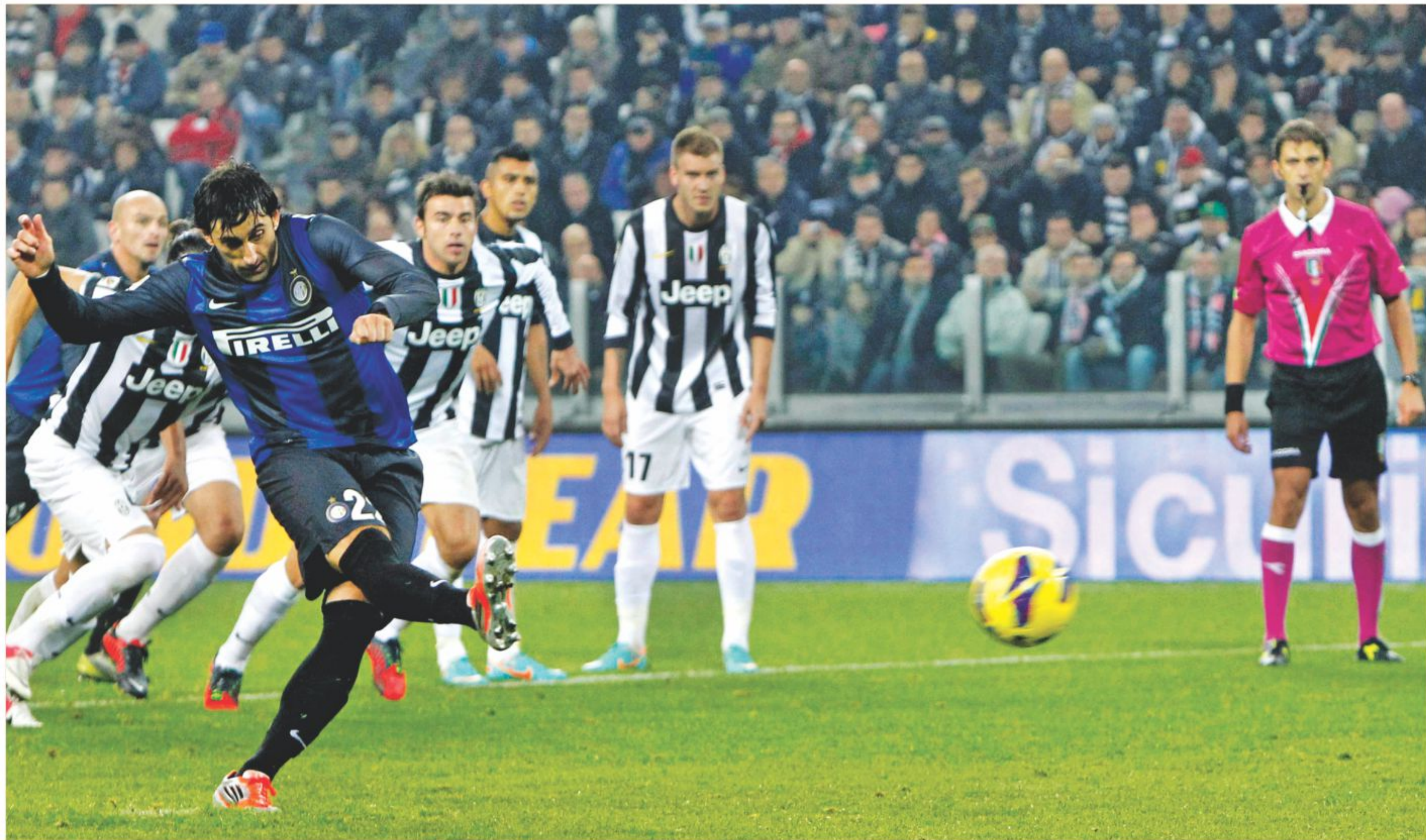
Inter Milan striker Diego Milito strokes home a penalty to set his side on way to a 3-1 win over Juventus during their Serie A clash in Turin on Saturday. Milito scored twice as Inter ended Juve's 49 game unbeaten run.