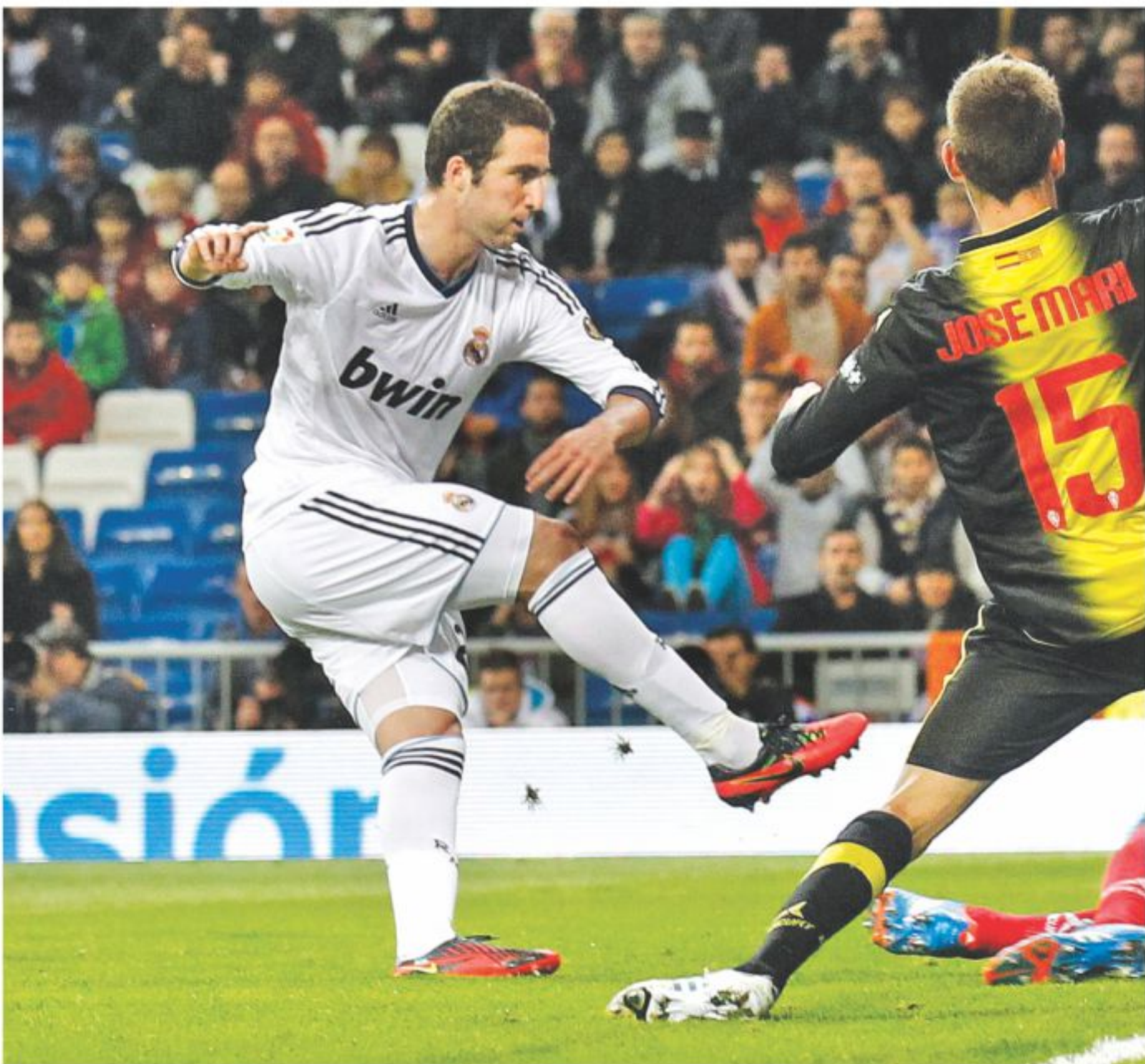
Real Madrid striker Gonzalo Higuain stabs the ball home from close range during their La Liga clash against Real Zaragoza at the Santiago Bernabeu on Saturday.

Bayern coach Jupp Heynckes was delighted with his team's performance and praised his foreign imports, including France's Franck Ribery and Croatia's Mario Mandzukic.