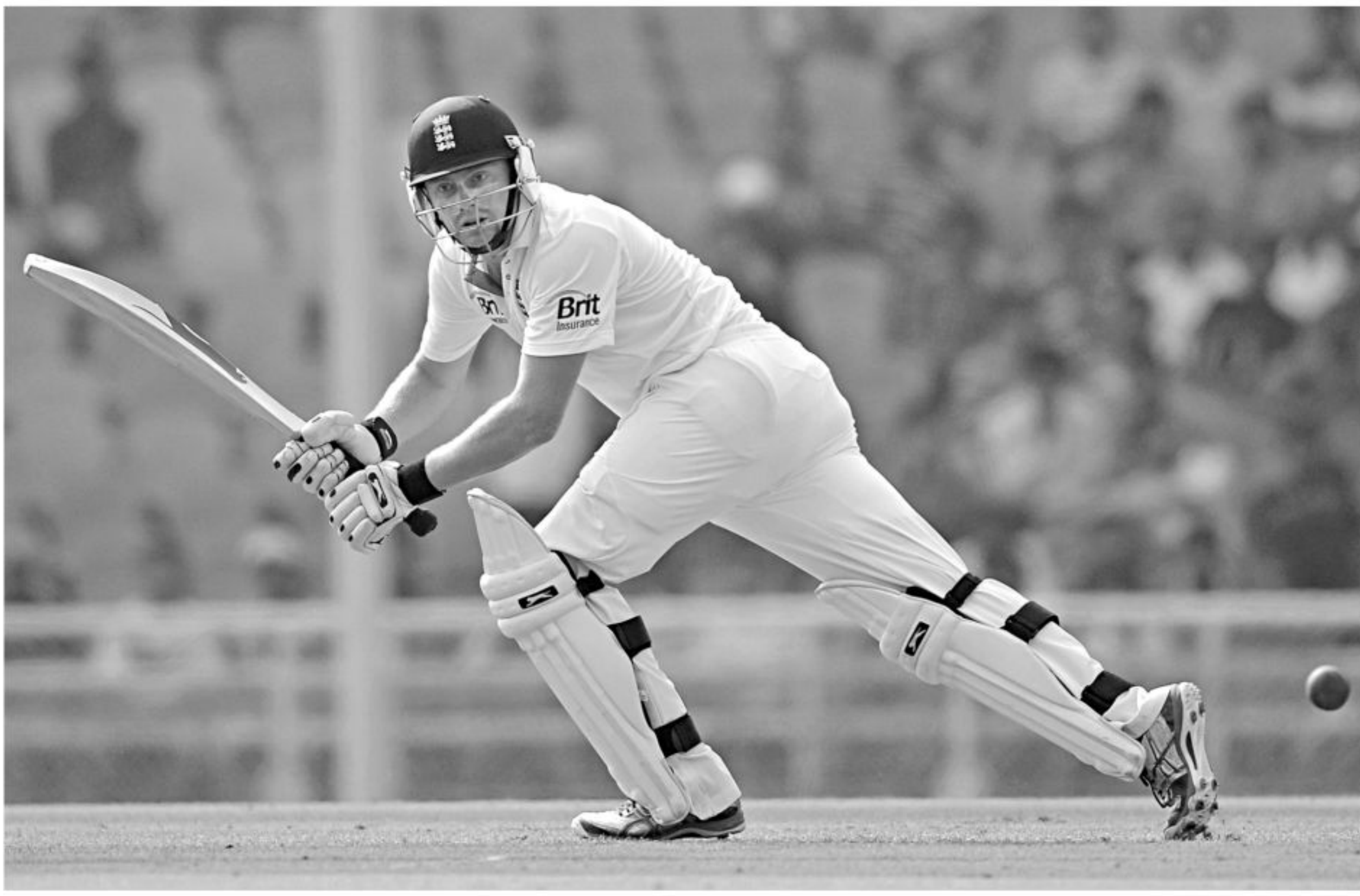
England batsman Jonny Bairstow nudges the ball away on the leg-side on way to scoring a century during the first day of a three-day practice match against Mumbai A and at the DY Patil Stadium in Mumbai yesterday.