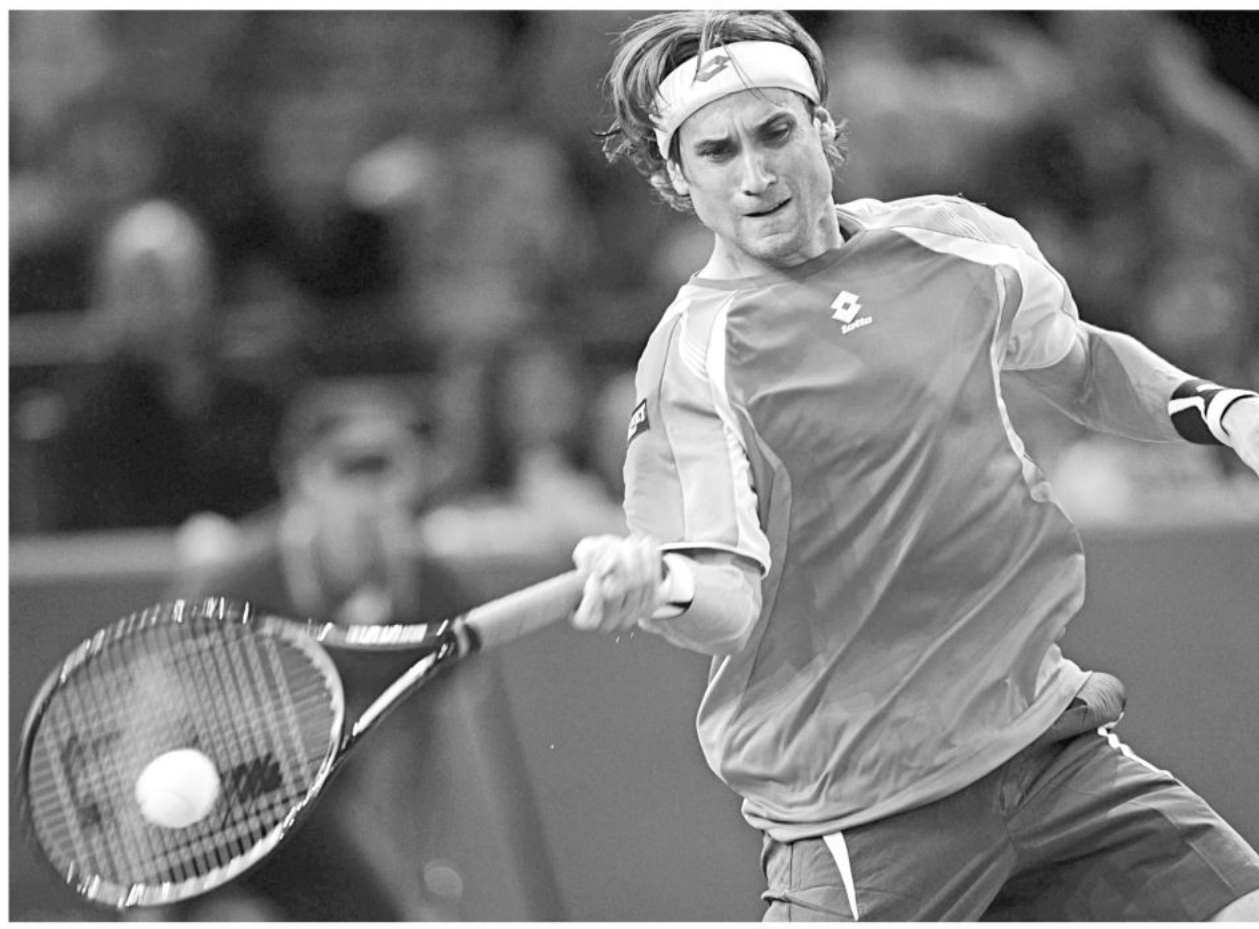
Spanish tennis player David Ferrer stretches to hit a forehand during his Paris Tennis Masters Series quarterfinal victory over France's Jo-Wilfried Tsonga on Friday.

He said he was satisfied with his performance and was happy to play well at a tournament that he loves in front of a home crowd, including his young son.