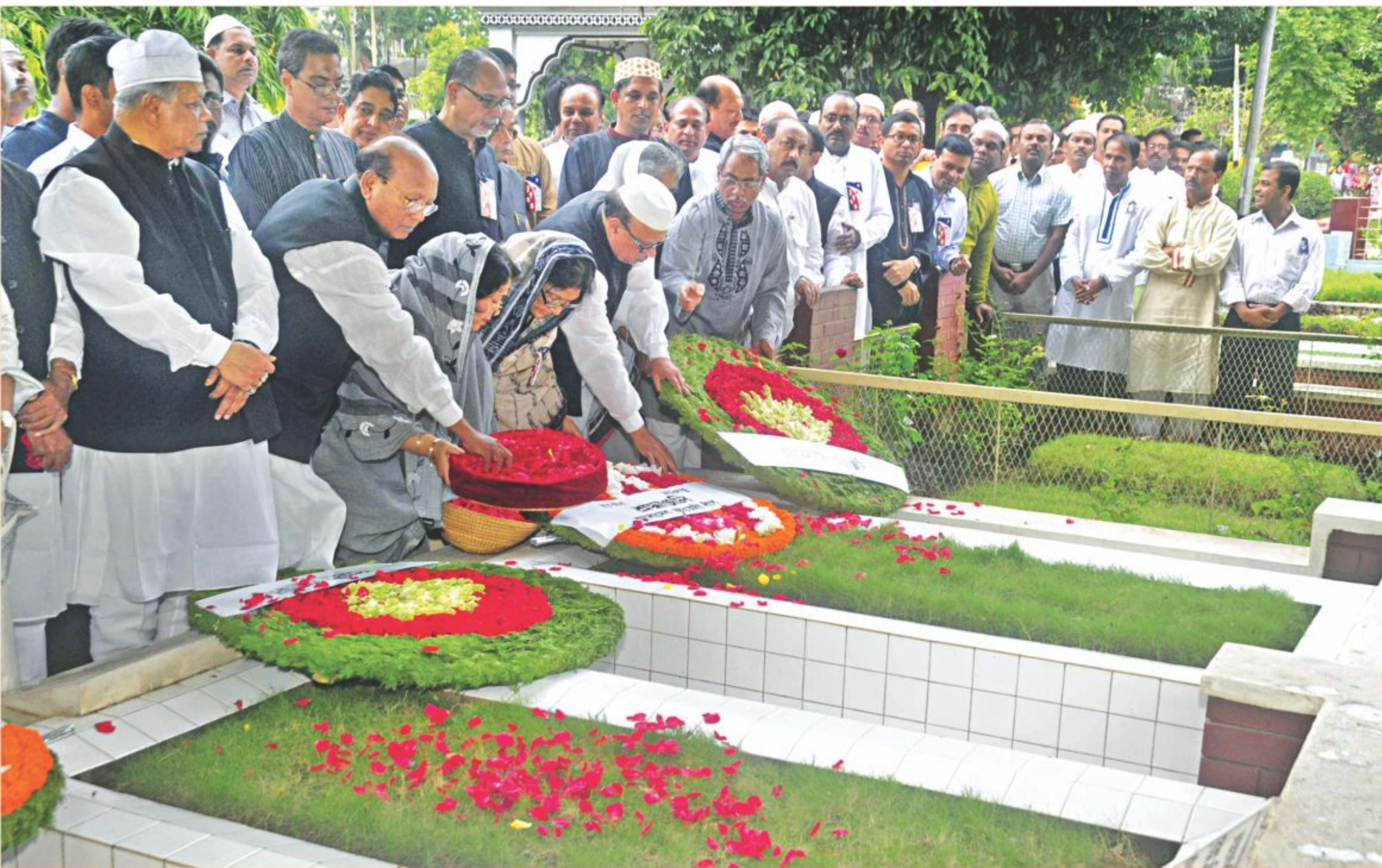
Leaders of the ruling Awami League place wreaths at the graves of three slain national leaders, Syed Nazrul Islam, Tajuddin Ahmad and Captain Mansur Ali, at Banani graveyard in the capital yesterday marking Jail Killing Day.