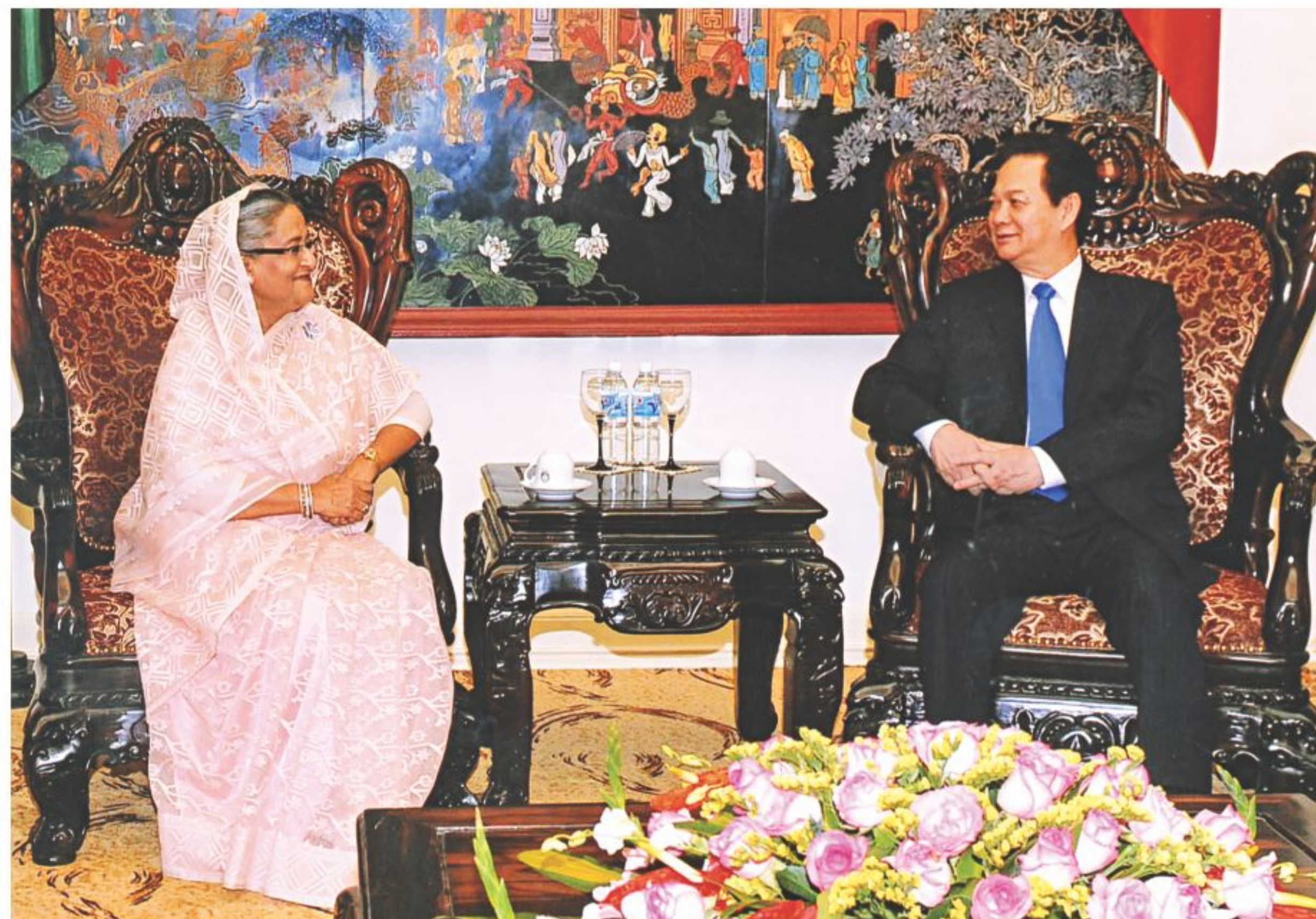
Prime Minister Sheikh Hasina meets her Vietnamese counterpart Nguyen Tan Dung at the latter's office in Hanoi, Vietnam yesterday.

His body was sent to a morgue while an unnatural death case was filed in this connection.