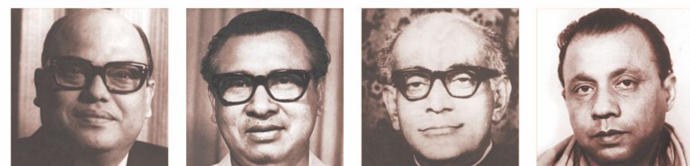
Syed Nazrul Islam

November 3 reminds brutal murder of the country's founding fathers