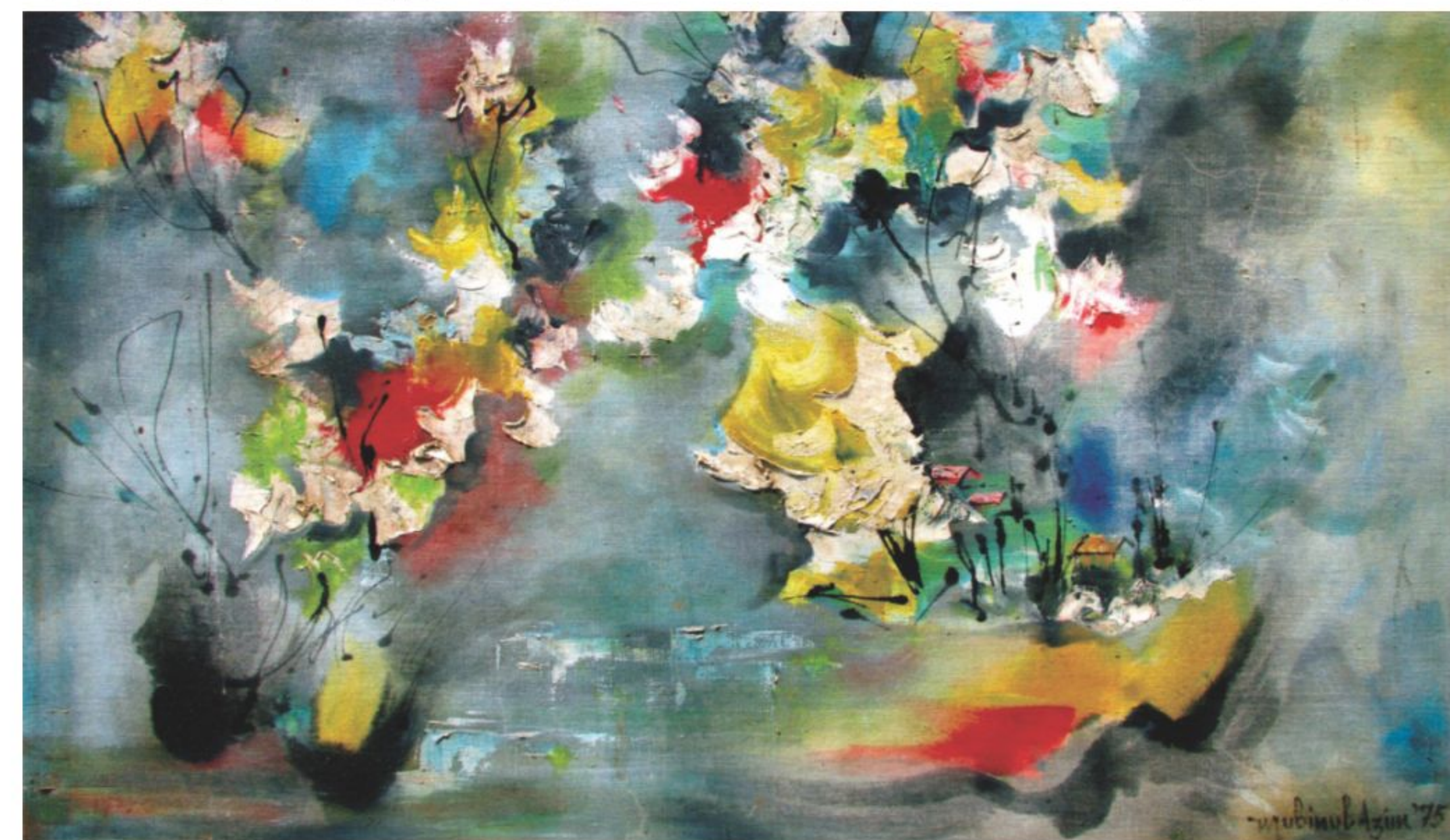
A painting by Mubinu Azim.

In 2012, the painter was posthumously awarded Ekushey Padak for his outstanding contribution to Bangladeshi art.