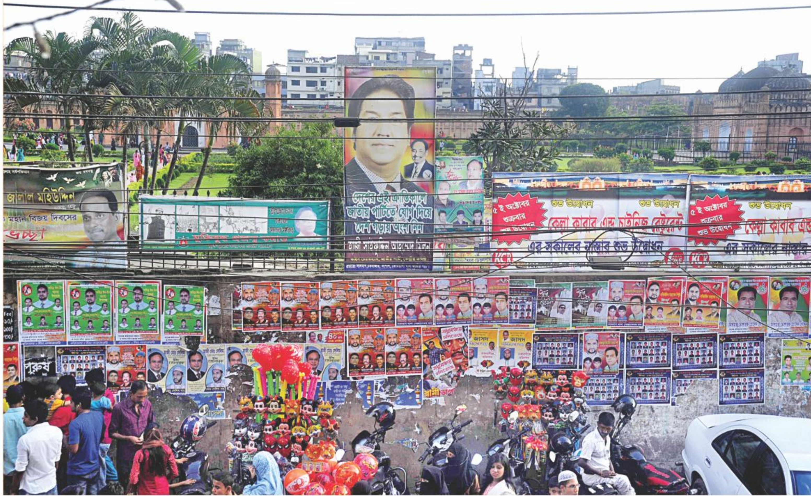
Posters and banners of ruling and opposition party leaders wrap the walls and surroundings of Lalbagh Fort in the capital hiding the beauty of this Mughal architecture.

During a 45-minute meeting with India's new Foreign Minister Salman Khurshid at the Hyderabad House here yesterday afternoon, Khaleda told him that connectivity between