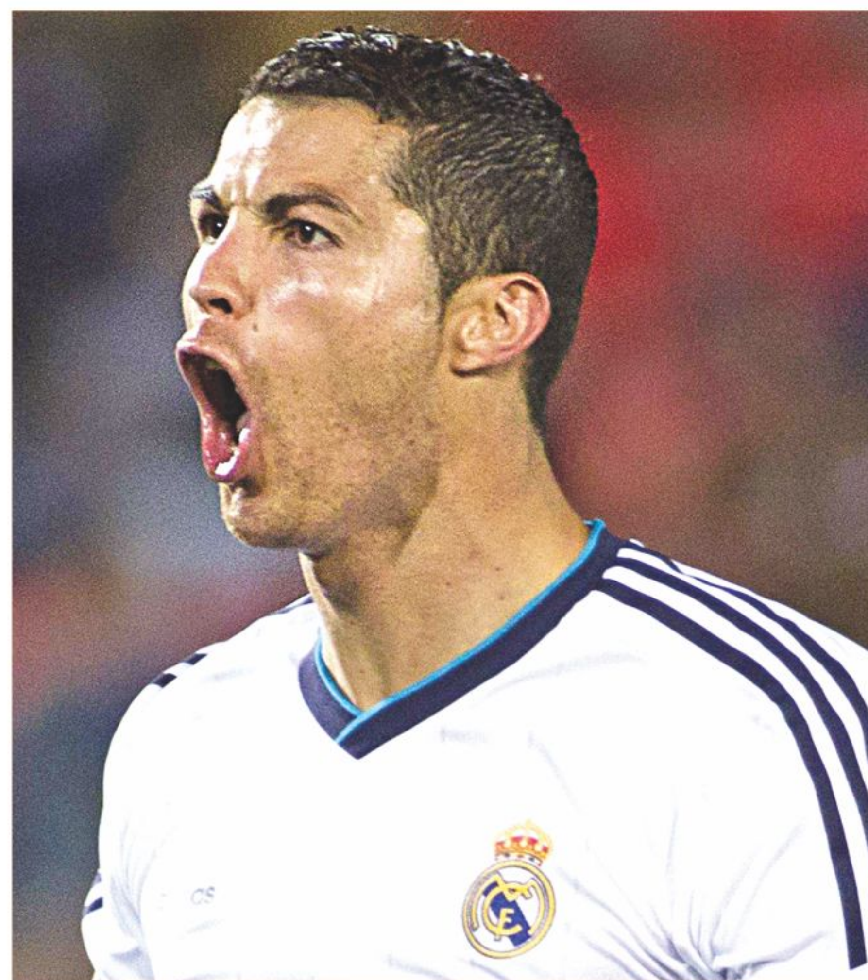
Real Madrid superstar Cristiano Ronaldo exults after scoring against Mallorca during their Primera Liga clash at the Iberostar Stadium on Sunday.