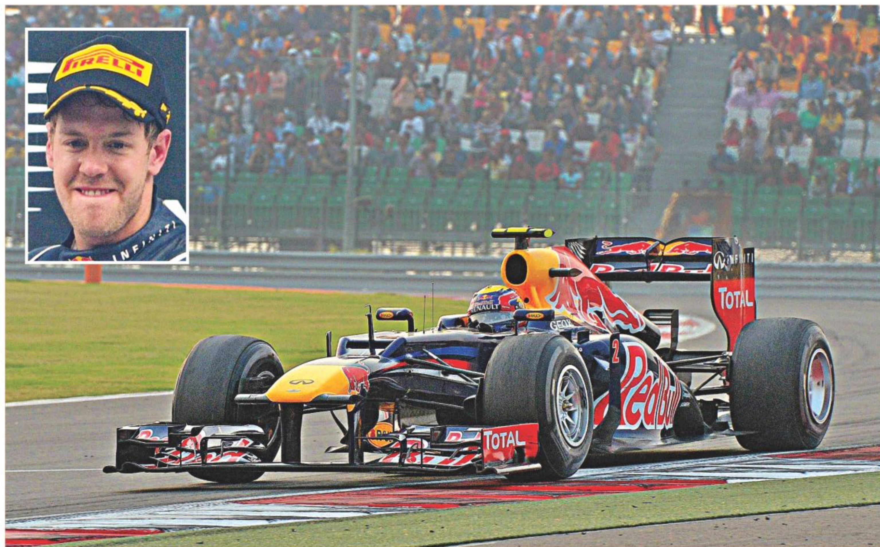
The Red Bull-Renault car driven by Sebastian Vettel (INSET) of Germany zooms through a bend during his winning drive in the Formula One Indian Grand Prix at the Buddh International circuit in Greater Noida in New Delhi on Sunday.