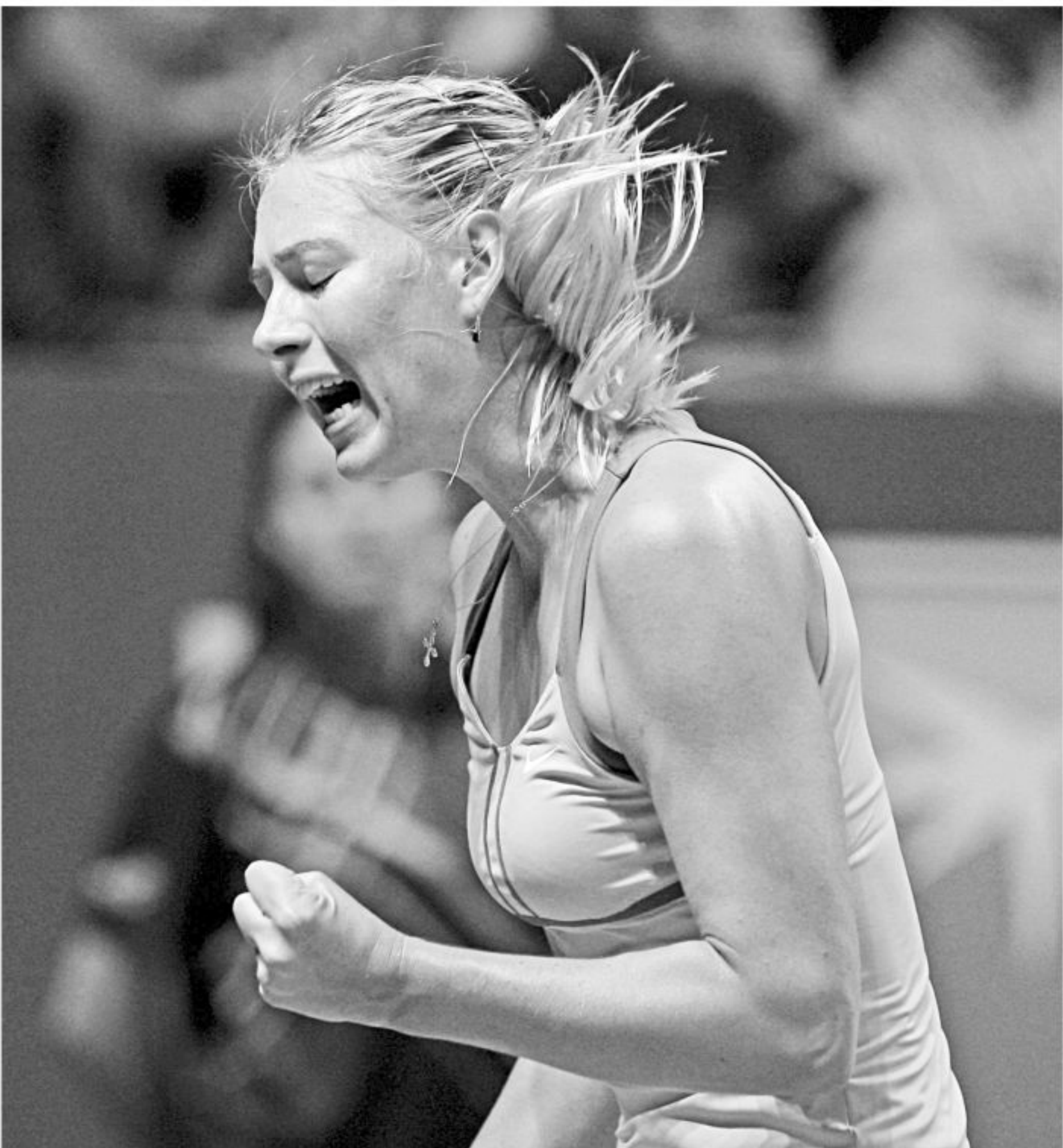
Maria Sharapova of Russia pumps her fist in celebration after beating Sara Errani of Italy in the round-robin stage of the WTA Championships in Istanbul on Tuesday. Sharapova won 6-3, 6-2.

ANI, London Opening batsman Nick Compton has said he is happy with the return of Kevin Pietersen in the England squad for the India tour, even though it could wreck his own Test dream. The Somerset star is part of the 17-man squad that flies to Dubai on Thursday for a training camp ahead of their India tour. Compton was selected as an opener along with Yorkshire's 21-year-old Joe Root, making him a potential replacement for retired ex-captain Andrew Strauss. But with Pietersen recalled to the tour party following his mid-summer madness, Jonathan Trott could move up the order, which could lead to Compton being left out of the squad for first Test starting on November 15. "His statistics and the sort of player he is speak for themselves. The chance to be with an England batsman of that calibre is fantastic," the Sun quoted Compton, as saying. "I don't know what the coaches or the selectors are thinking. All I can do is go out there in the warm-up games and give the best account of myself," he added. "If I do, hopefully I can put my hand up for a spot. The top three is a place I've identified. KP bats in the middle order so whether we're competing there as well I have no idea," he said. Compton added: "But if there's an opening spot it's something I would like to grab with both hands."