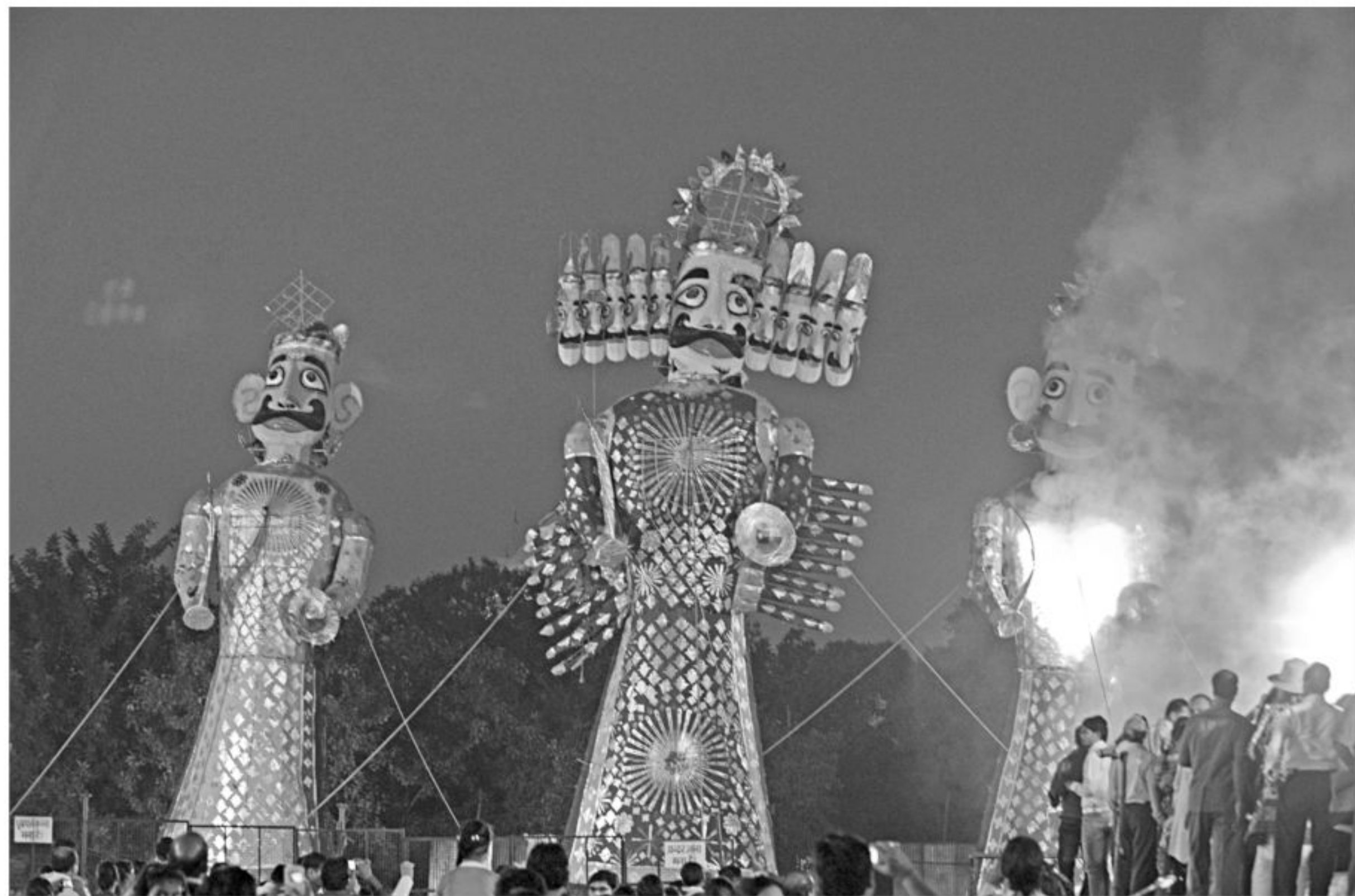
Fireworks-laden effigies of the Hindu demon king Ravana, centre, his brother Kumbhkuram, right, and son Meghanad are set alight as Hindu devotees gather for the Hindu festival of Dussehra in New Delhi yesterday. Dussehra, which is celebrated at the end of the Navratri (nine nights) festival, symbolises the victory of good over evil in Hindu mythology.

AFP, Miranshah A US drone fired two missiles at a suspected militant compound in north-west Pakistan yesterday, killing three people, security officials said. One missile hit a house in the Tappi area about 20 kilometres east of Miranshah, the main town in North Waziristan tribal district, which is a stronghold of Taliban and al-Qaeda-linked militants. The other hit a vehicle parked outside. Earlier this month, cricket legend turned politician Imran Khan led thousands of supporters in a motorcade from the capital Islamabad to the edge of the tribal belt to protest against the US strikes.