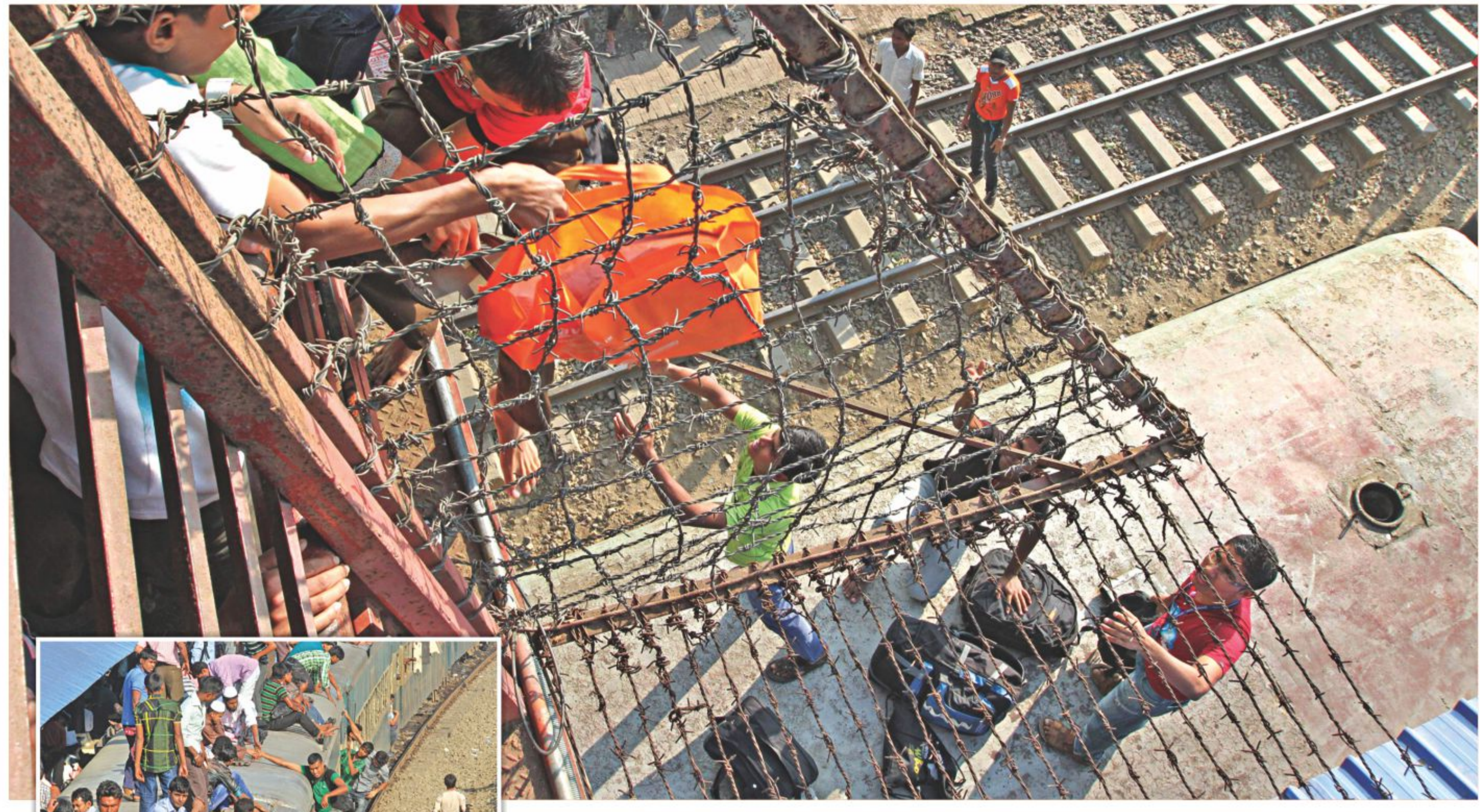
Passengers desperate to go home to celebrate eid try to land on the roof of a train from a footbridge ignoring a barbed wire fence yesterday at the Airport Railway Station. Many others, inset, resort to climbing up to the roof. More photo on page 5.