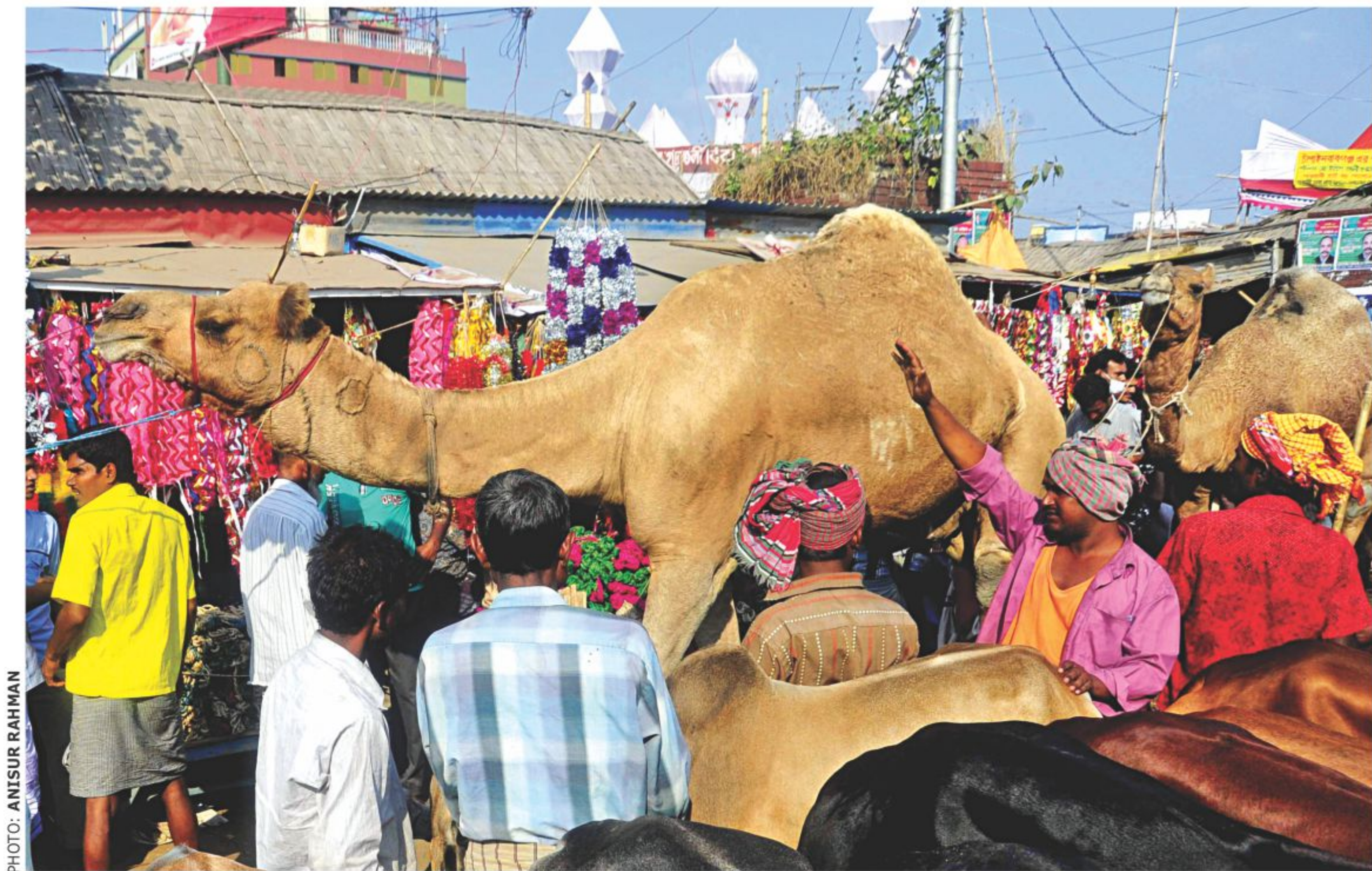
A businessman of Chittagong bought the two camels from Gabtoli cattle market in the capital yesterday for Tk 13 lakh. Camels have been featuring in cattle markets of the capital alongside cows, goats and sheep. However, they are pricey and most people cannot afford them.