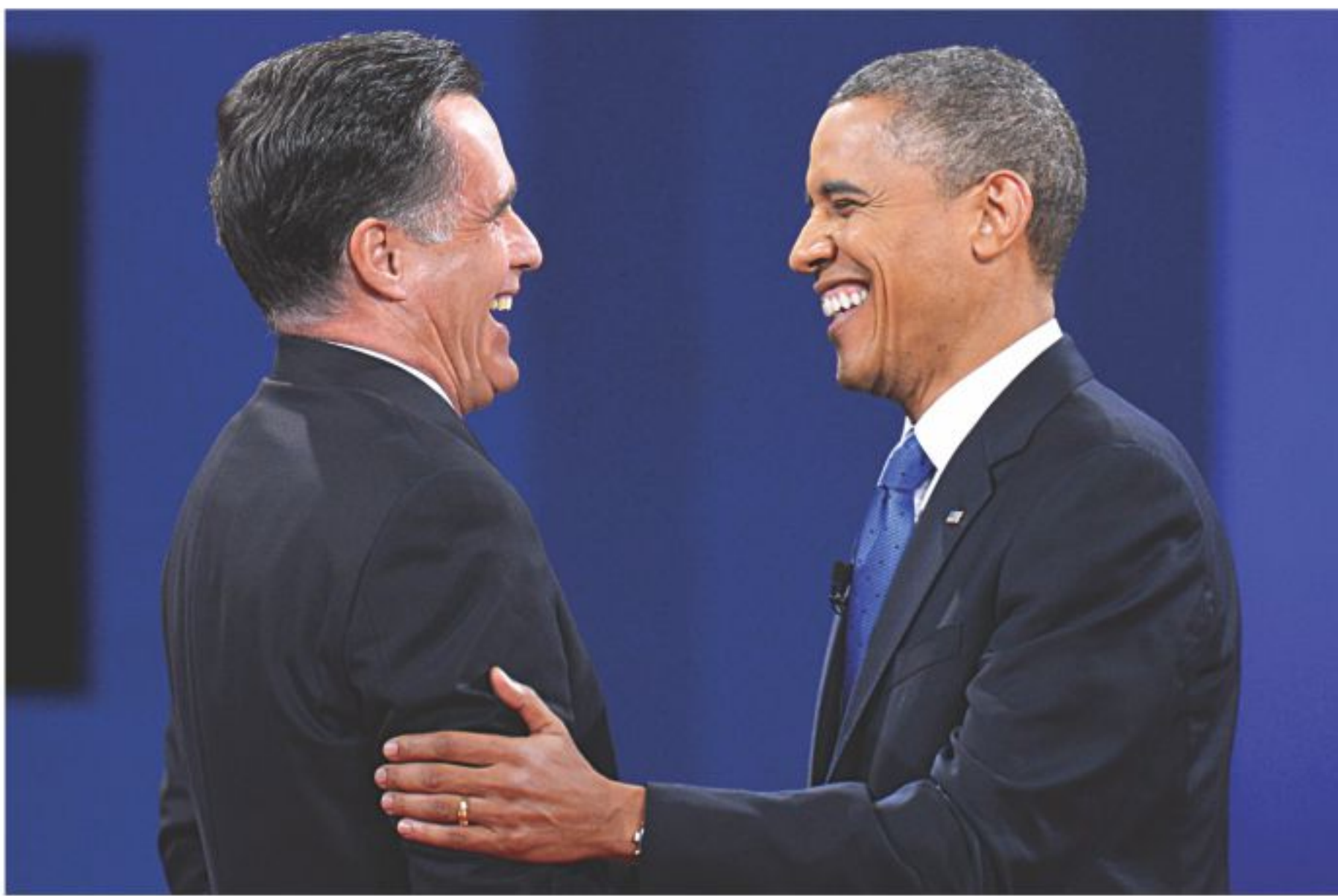
US President Barack Obama and Republican presidential candidate Mitt Romney shake hands at the end of the third and final presidential debate at Lynn University in Boca Raton, Florida yesterday.

Around 200 people sustained injuries, mostly from rubber bullets, as several thousand garment workers of Hall-Mark Group clashed with law enforcers during their demonstrations for arrears and Eid bonus in Savar in Dhaka yesterday. The sporadic demonstrations left around 30 vehicles ransacked and a three-hour-long tailback on Dhaka-Aricha Highway causing immense sufferings to the people bound for home to celebrate Eid. SEE PAGE 7 COL 4 PHOTOS ON PAGE 3