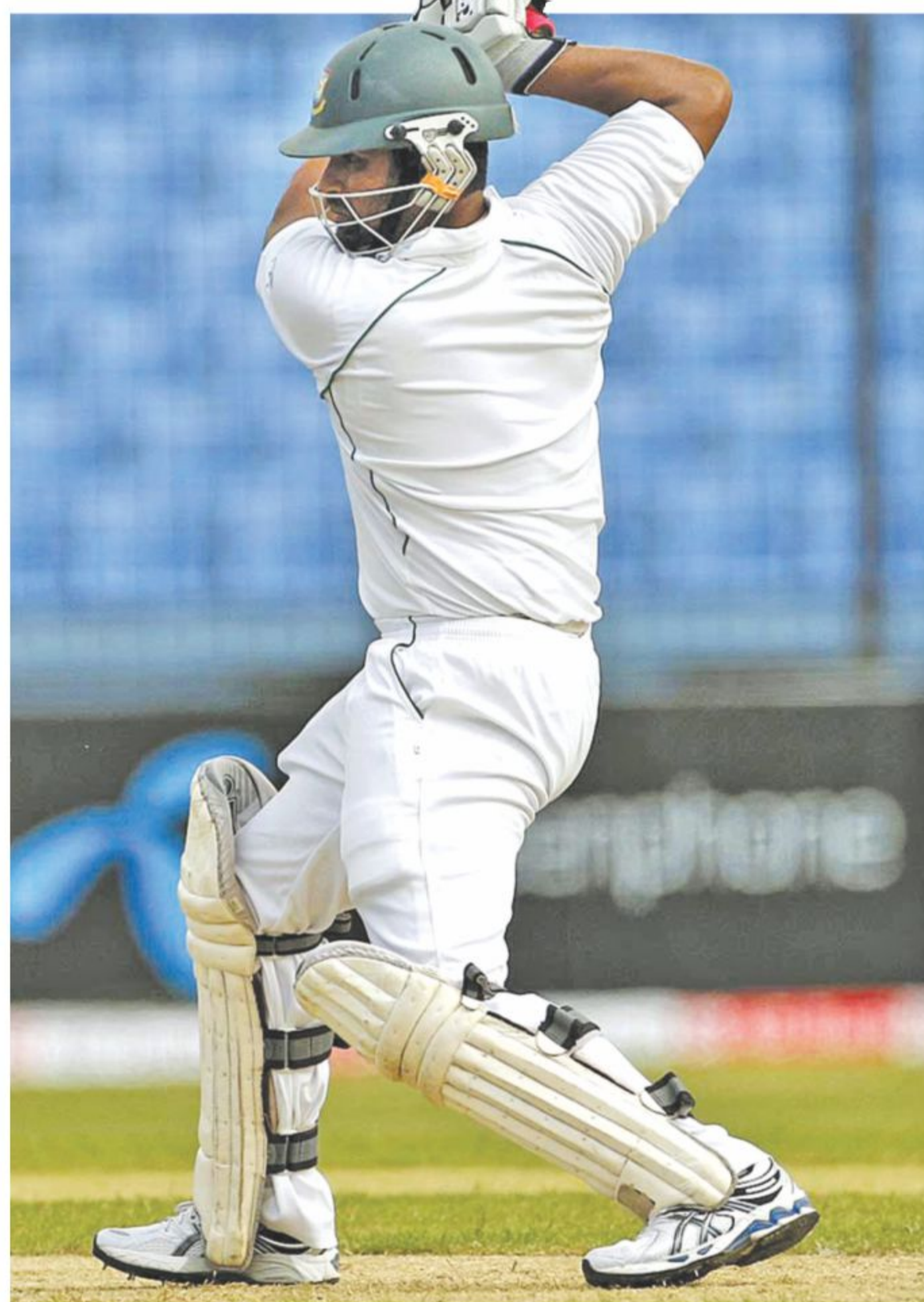
Chittagong captain Tamim Iqbal was in imperious form in the first-round National Cricket League match against Dhaka Metro in which he struck a century in each innings, the second of which was a 104-ball 113 at the Shaheed Chandu Stadium in Bogra yesterday.