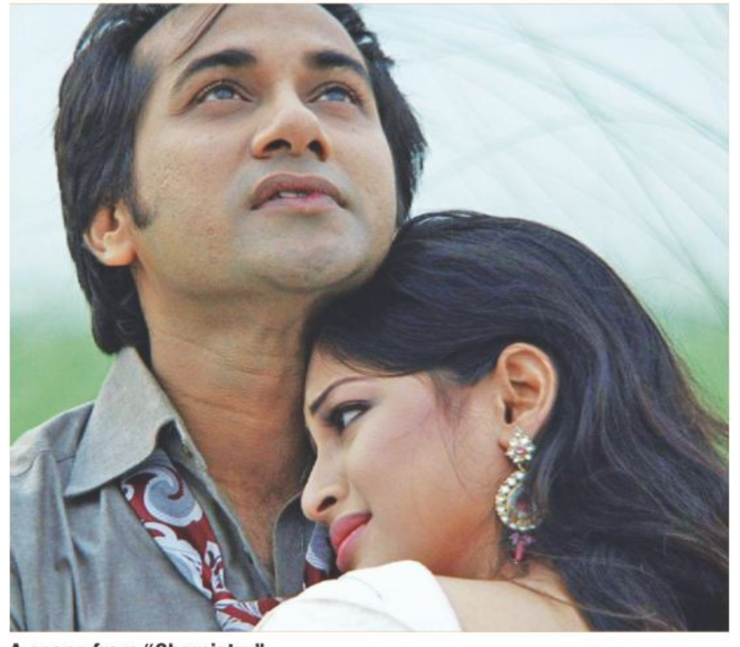
A scene from "Chemistry".