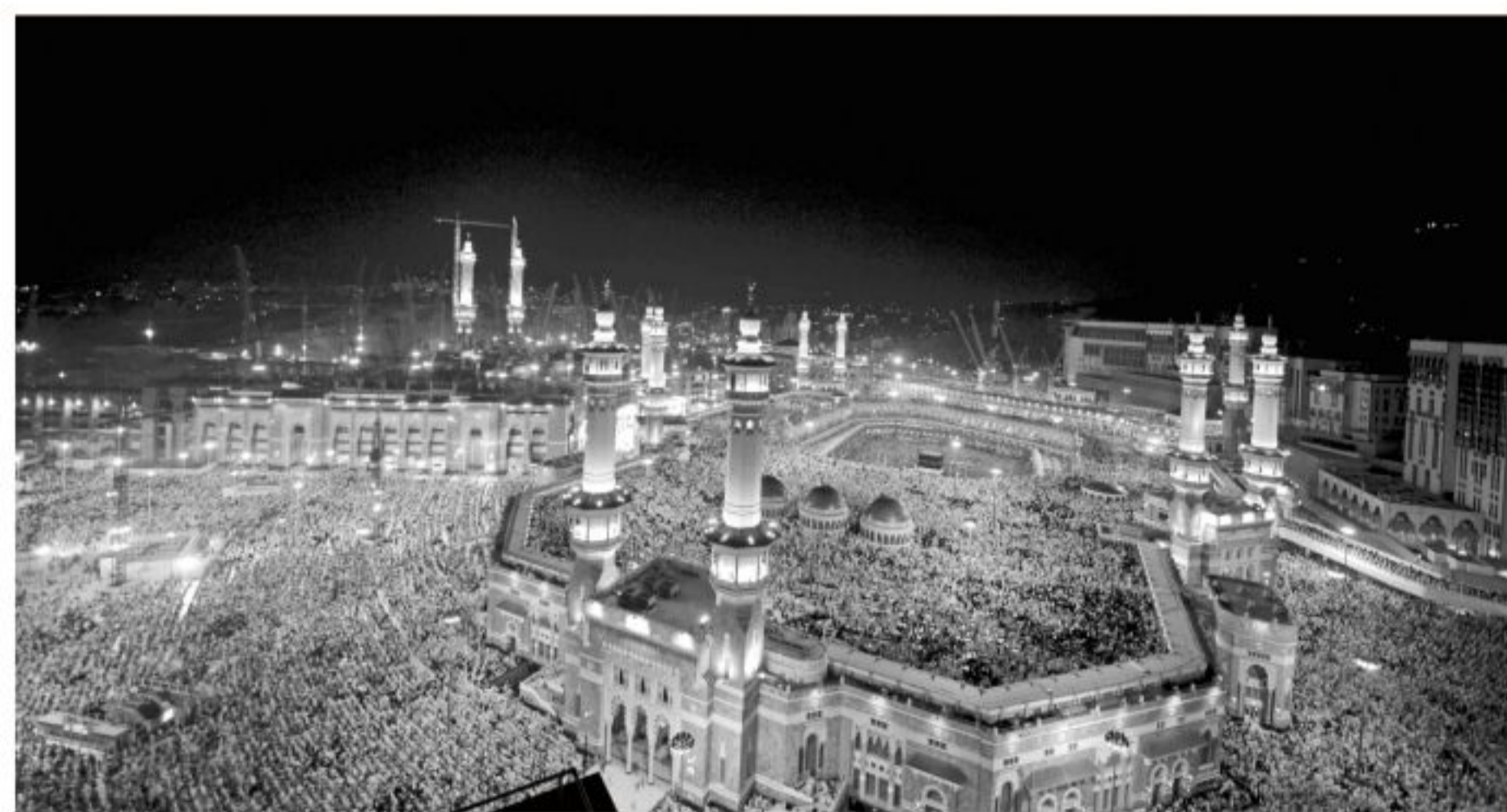
Muslim pilgrims perform their prayers in the Grand Mosque of the holy city of Makkah on Monday. Over two million Muslims from around the world flood the Saudi city to perform the annual Hajj pilgrimage which begins tomorrow.

Two pro-government fighters were killed near Bani Walid on Monday. Libya state news agency LANA said on Sunday that 22 pro-government militiamen had been killed and some 200 wounded, but it did not say when.