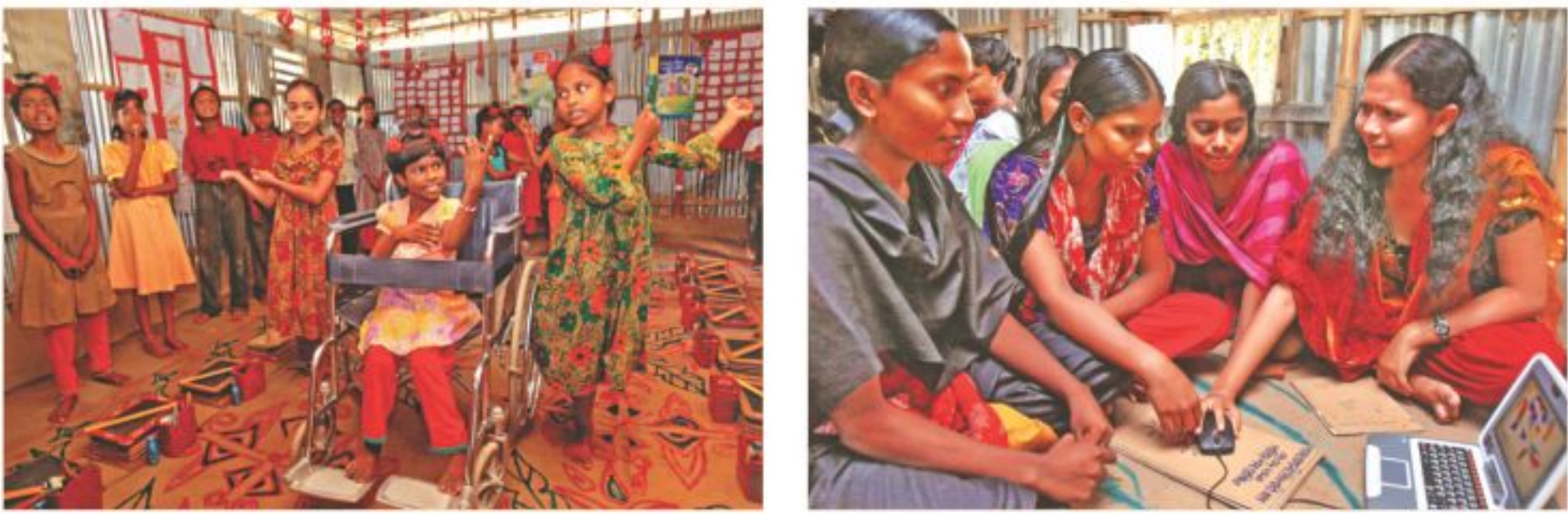
The images were not just about one theme or personality but about people, who had become empowered in a triumphant act of self-empowerment.