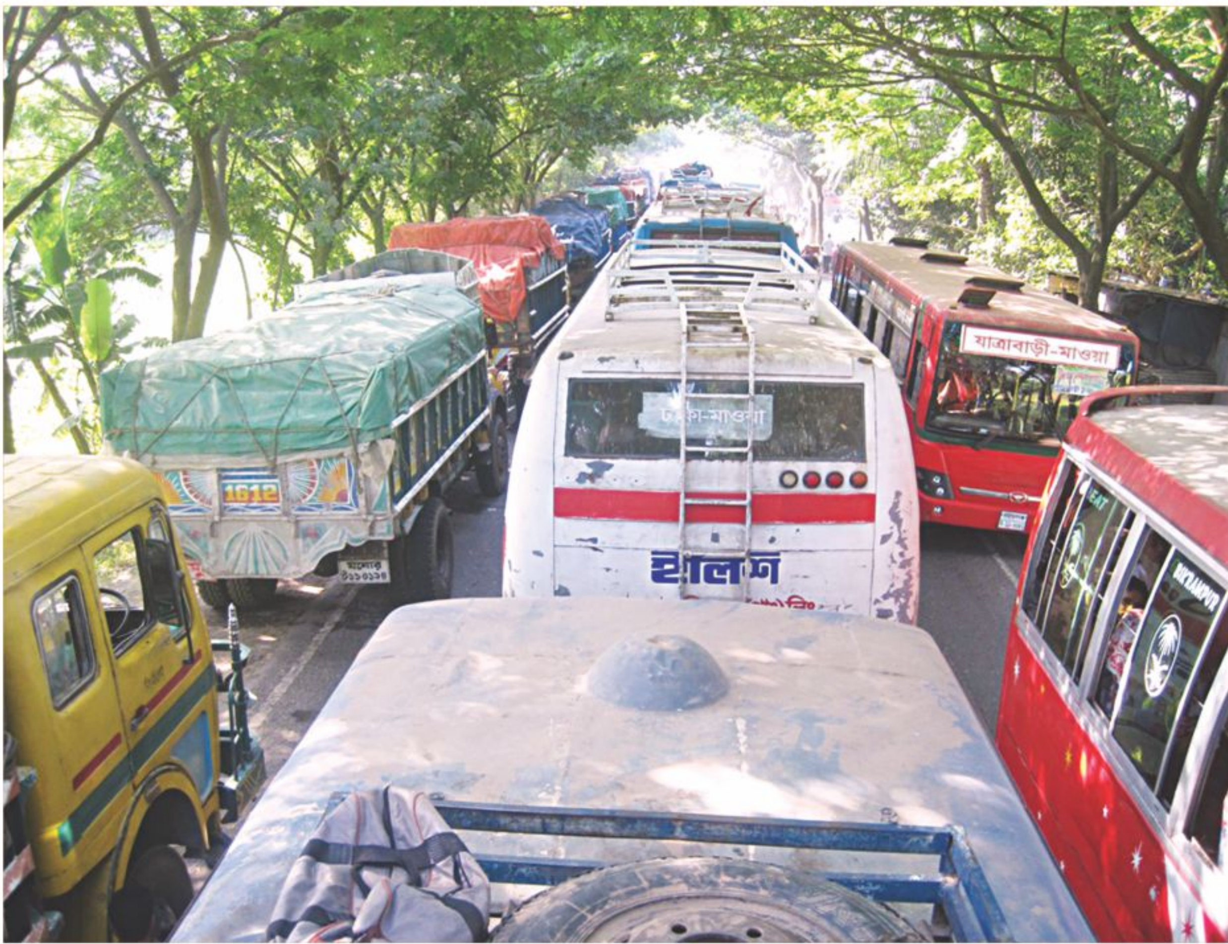
A long tailback of vehicles at Mawa Ferry Terminal yesterday, as only one ghat remains in operation ahead of Eid-ul Azha after three other ghats were either eroded or damaged recently.

Our Thakurgaon correspondent reports, a bus helper was killed and 25 others were injured as the bus fell into a ditch beside Tentulia-Banglabandha road at Bamonpara village in Tentulia upazila of Panchagarh yesterday. Tentulia Police Station Officer-in-Charge Manoj Kumer said the bus plunged into the roadside ditch while it was giving side to a truck at about 12:10pm, killing the helper and injuring the 25 others. Of the injured, 21 were admitted to Panchagarh Sadar Hospital. UNB from Comilla reports, three motorcyclists were killed when a cattle-laden truck rammed their bike on Comilla-Chandpur road at Chandtara in Laksam upazila early yesterday. The deceased were identified as Sohel Saha, son of Asim Saha of East Laksam, Arun Saha, son of Binod Saha, and Sohag Barman, son of Romni Barman of North Laksam. In Shariatpur, schoolboy Rabin, 12, son of Fazlul Haque, died as a speeding bus ran him over in Sajonpur area of Vederganj upazila at about 3:00pm on Sunday.