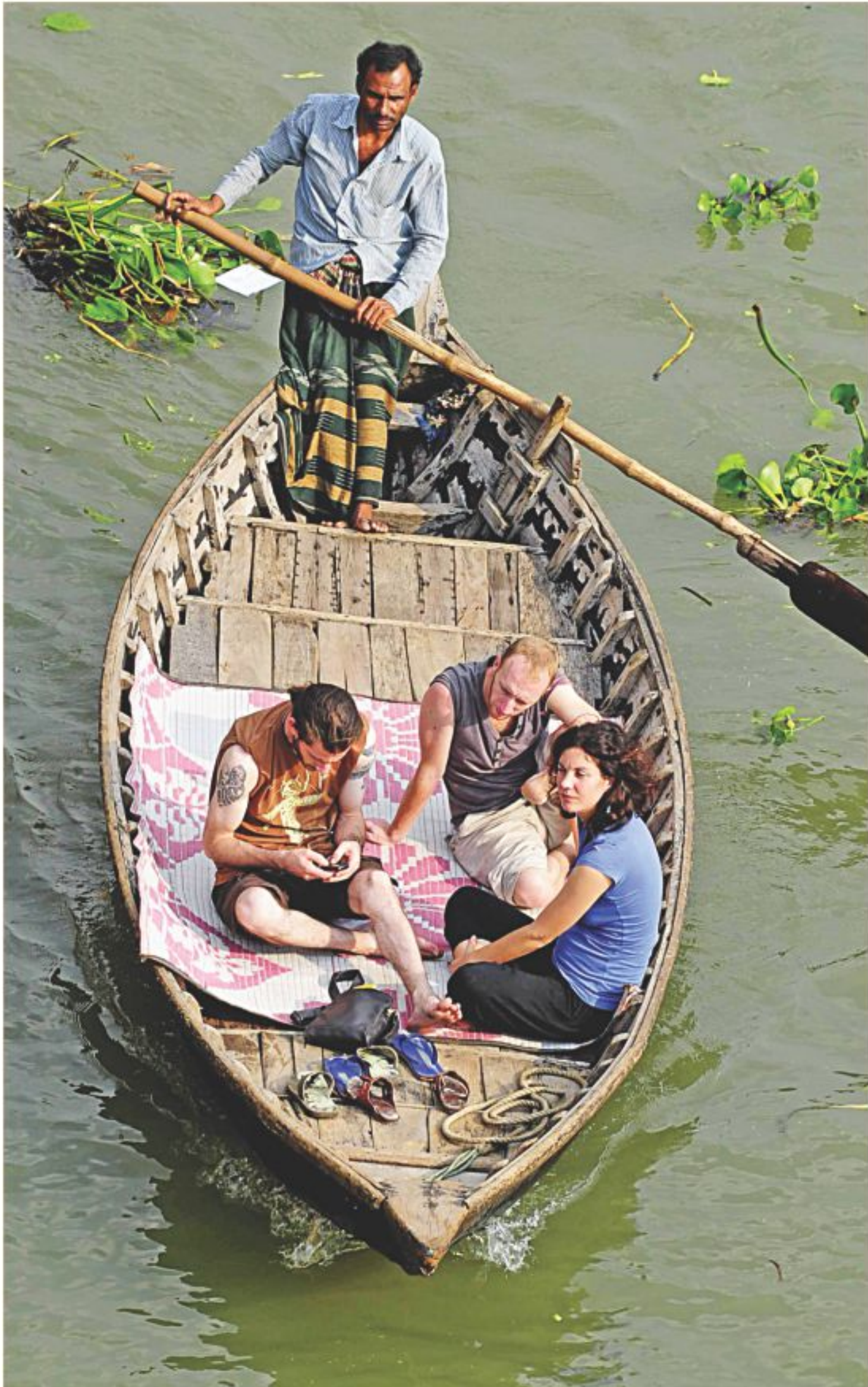
Foreign tourists enjoy a ride in the Buriganga river on Sunday. Usually the water of the river is pitch black with pollution, but during this time of the year the flow of water is greater, making it clearer and less polluted.