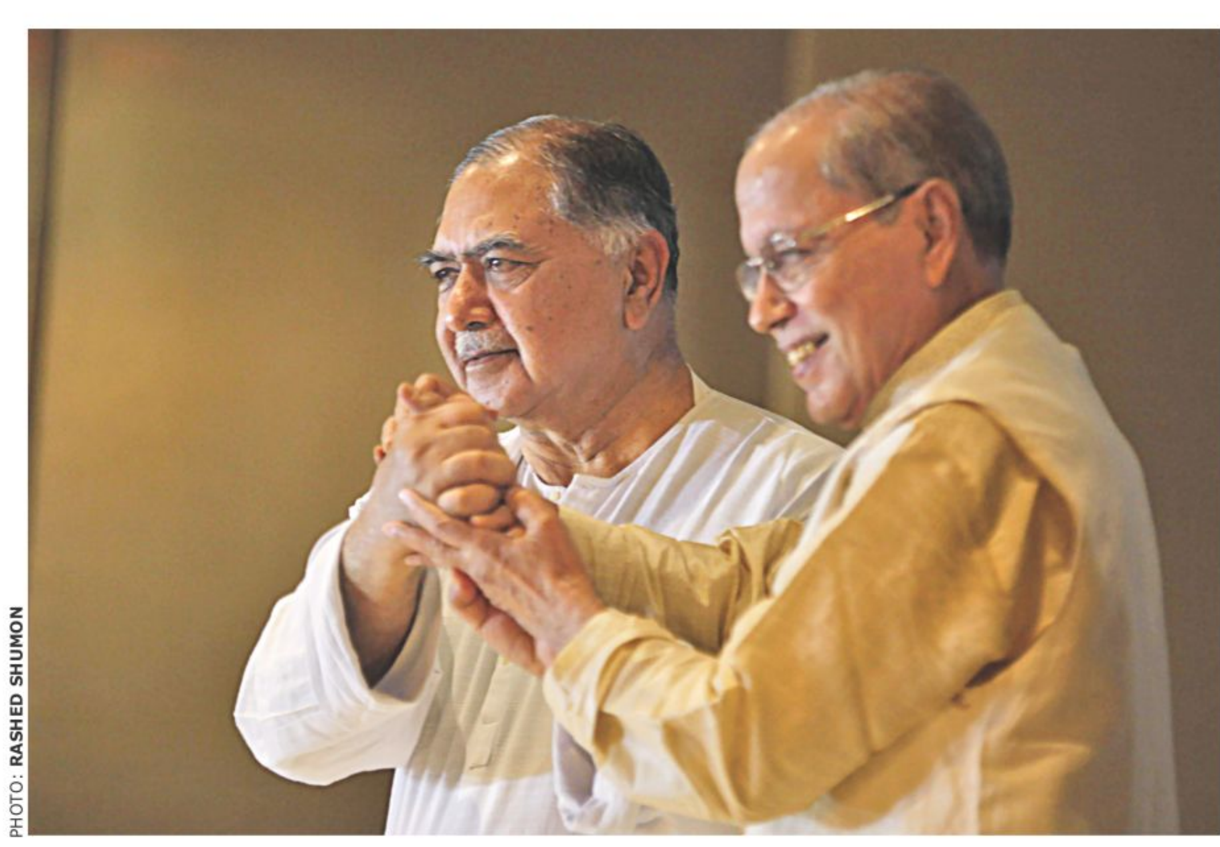
Gonoforum President Dr Kamal Hossain and Bikalpa Dhara Bangladesh President AQM Badruddoza Chowdhury make a gesture of unity during a function at Radisson Water Garden Hotel in the capital yesterday.

STAFF CORRESPONDENT Gonoforum President Dr Kamal Hossain and Bikalpa Dhara Bangladesh President AQM Badruddoza Chowdhury have called for a "national unity" for a prosperous Bangladesh. "The country is plagued with diseases .... Awakening the masses is the only medicine," Dr Kamal told a function at Radisson Blue Water Garden Hotel in the capital yesterday. The eminent jurist said some people at upper tiers were crossing their limits in exercising power because of their unlimited greed. SEE PAGE 19 COL 2