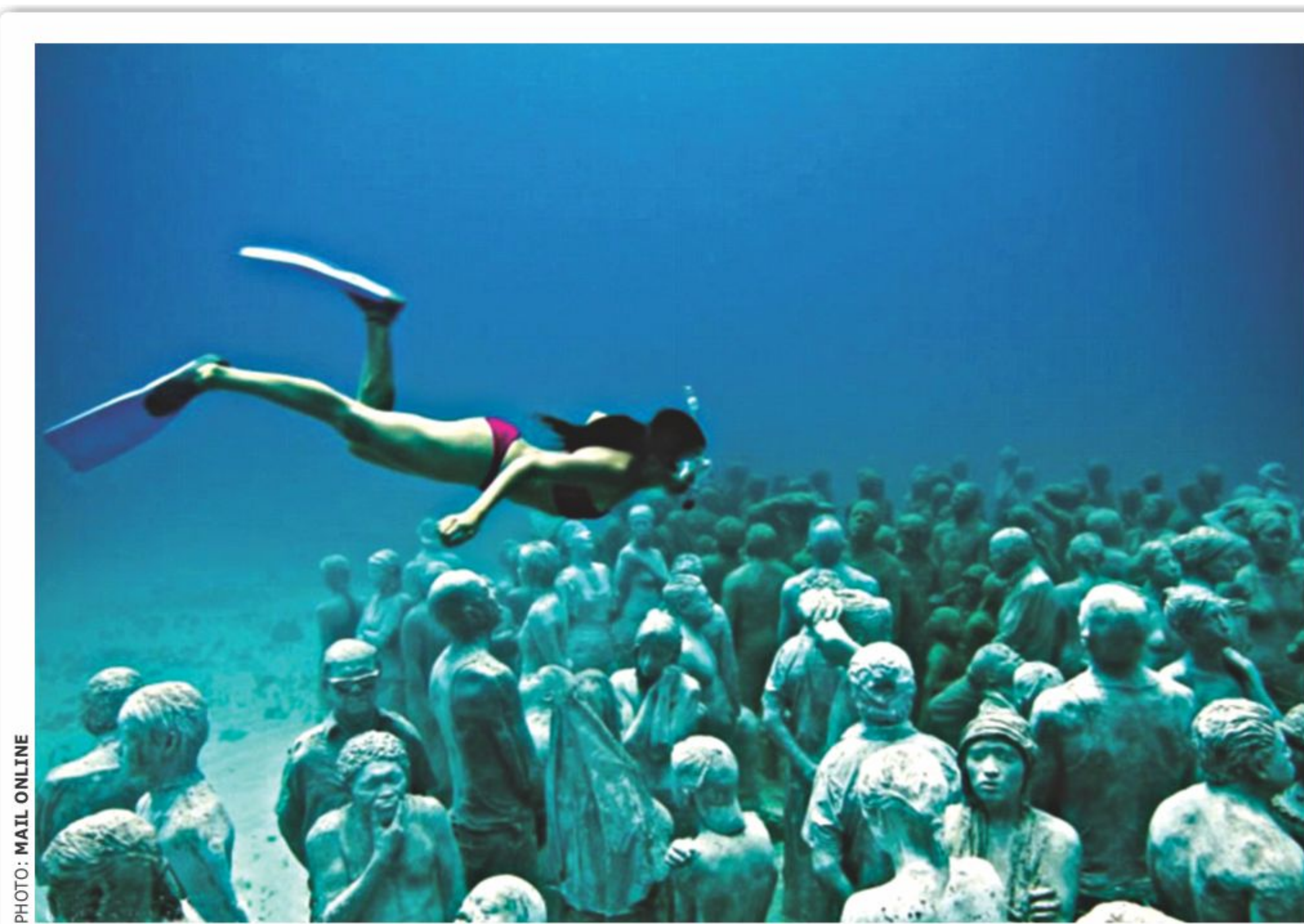
A British artist's underwater sculpture gardens, planted off the coast of Cancun, Mexico, encase hundreds of life-sized men, women and children. Divers are not only welcome but encouraged to explore the hundreds of detailed bodies and faces otherwise left in the quiet company of fish and creeping coral reefs. The mission of 37-year-old artist Jason de Caires-Taylor is to distract divers from the nearby Mesoamerican Reef, the second largest barrier reef in the world, that struggles to handle the swarming tourists annually.