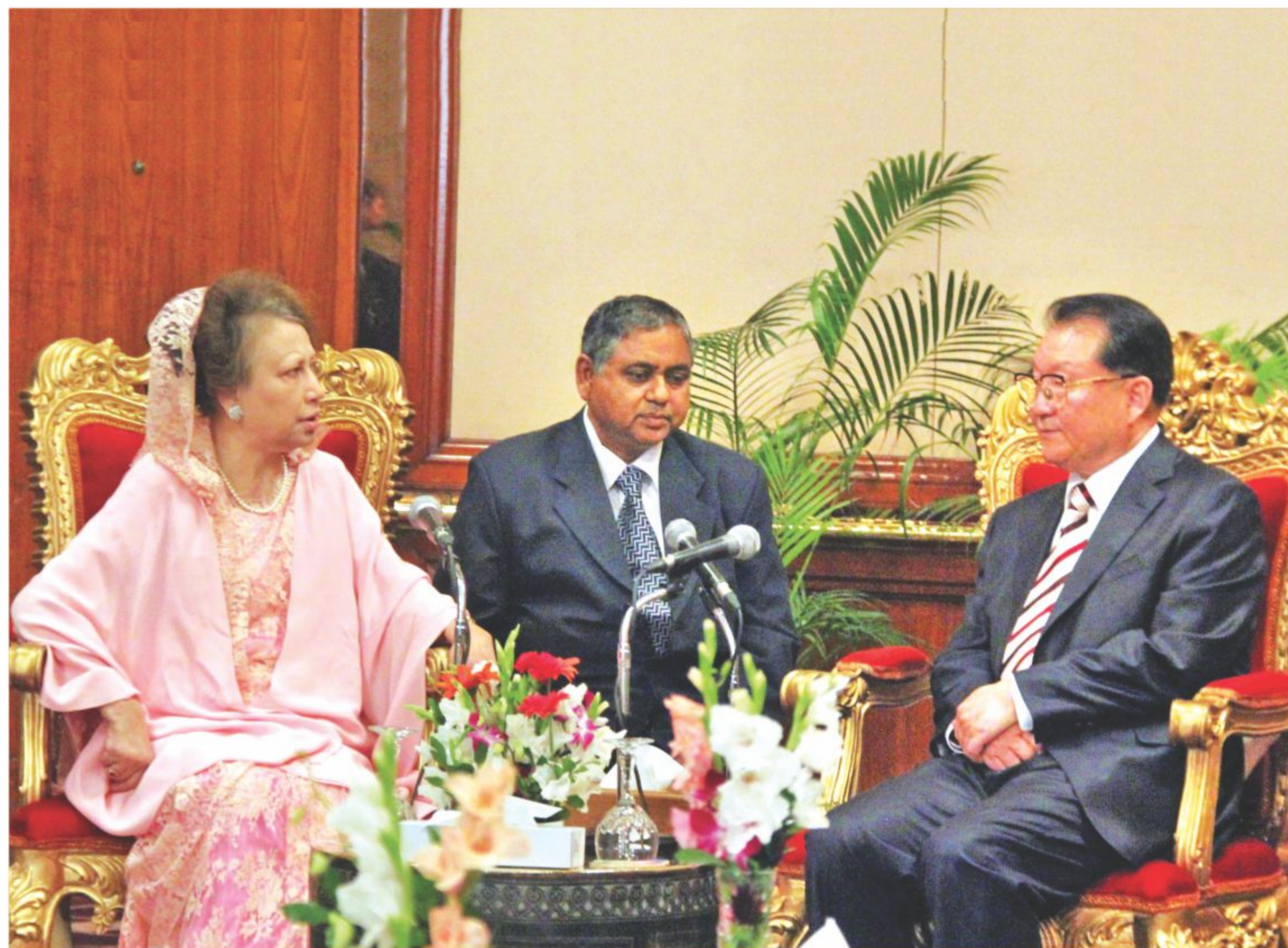
Leader of the Opposition and BNP Chairperson Khaleda Zia calls on Li Changchun, member of the Standing Committee of the Political Bureau of Communist Party of China Central Committee, at Sonargaon Hotel in the capital yesterday.