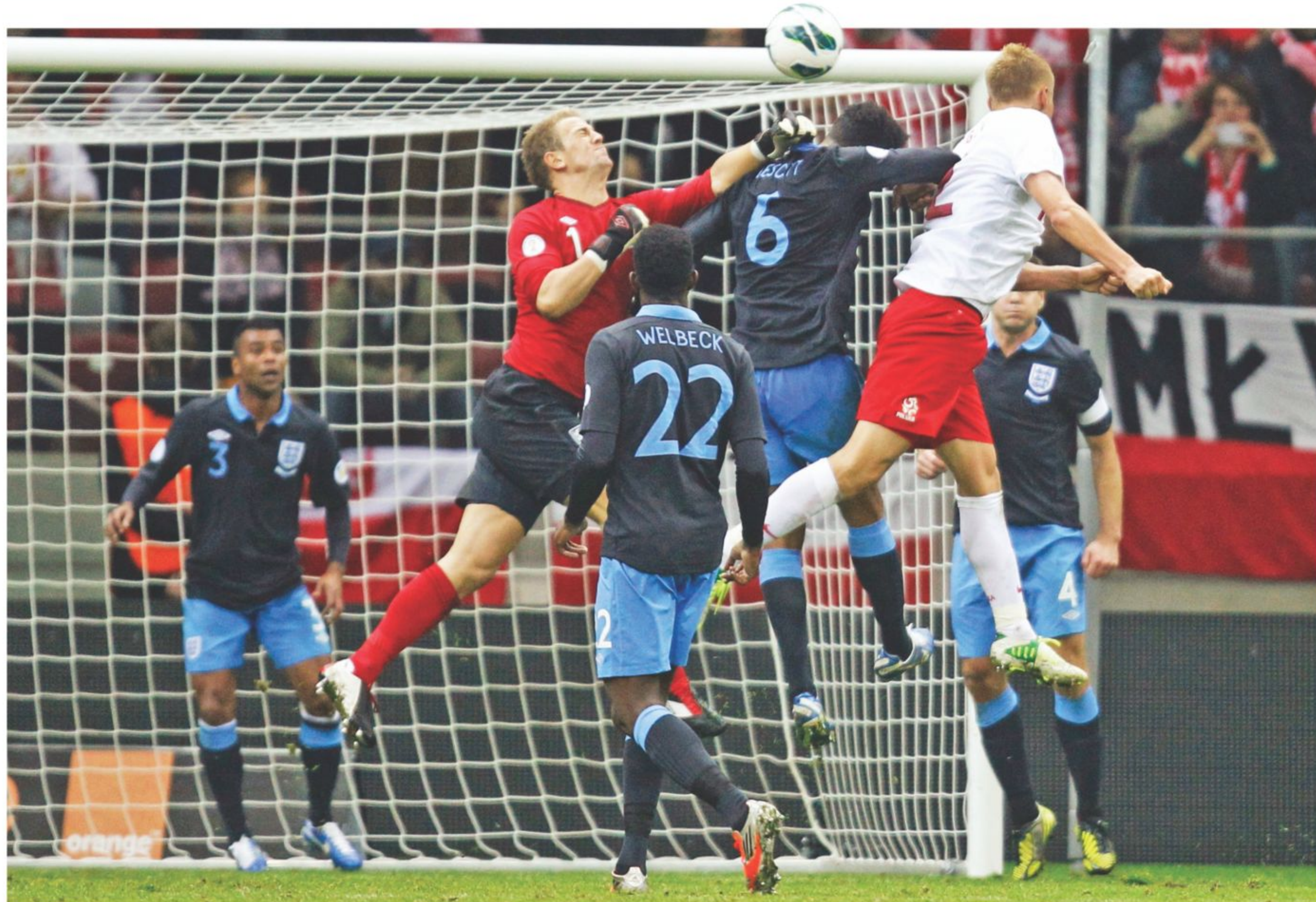
Poland defender Kamil Glik (R) heads home the equaliser during their 2014 World Cup qualifier against England at the National Stadium in Warsaw on Wednesday.

GP Federation Cup SEMIFINAL Sk Russel v Mohammedan Time: 5:00pm Venue: Bangabandhu