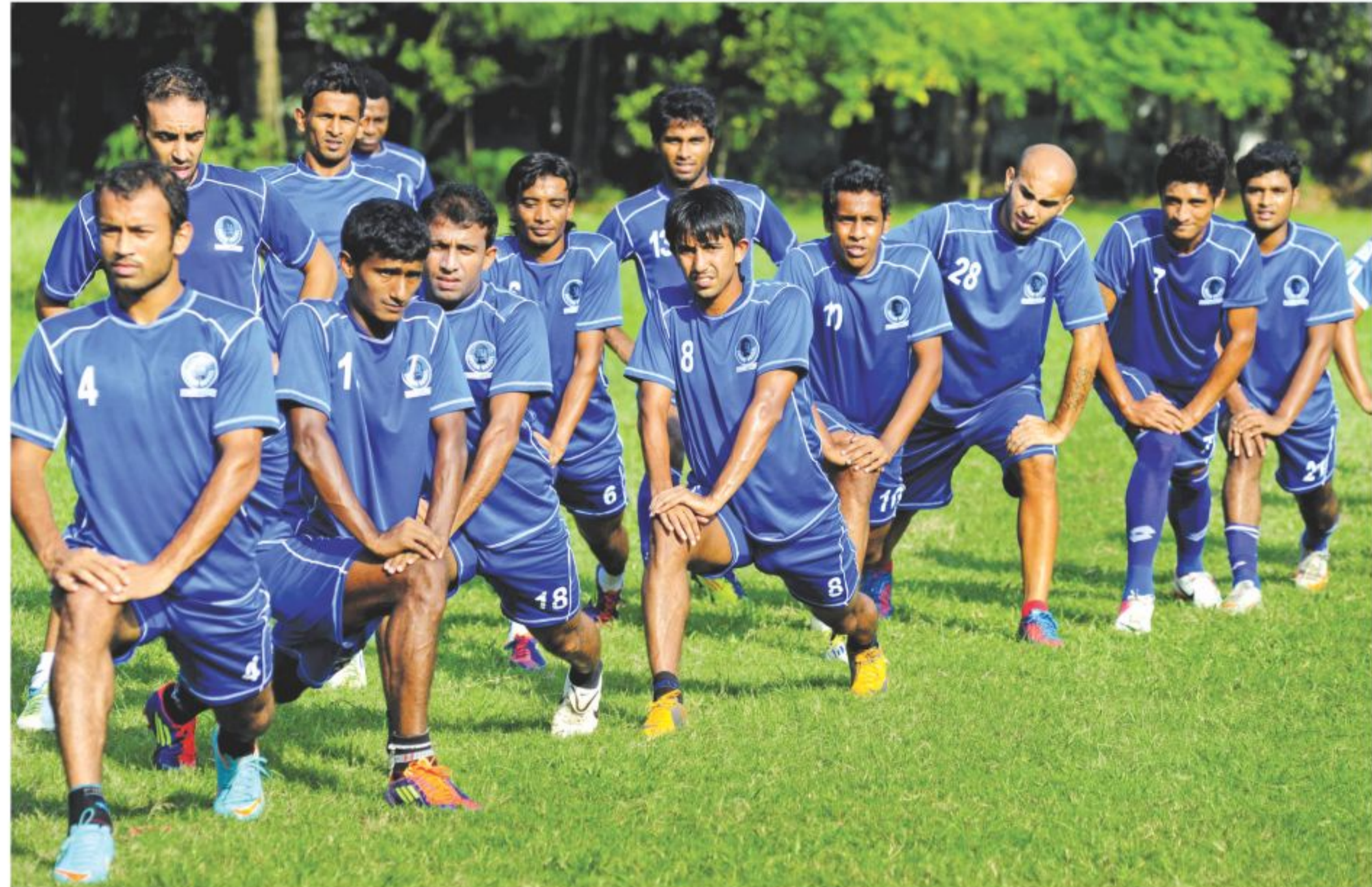
Mohammedan Sporting Club football players (L) limber up during practice while their opponents in today's Grameenphone Federation Cup semifinal Sheikh Russel (R) do some stretching of their own at the BUET Ground yesterday.