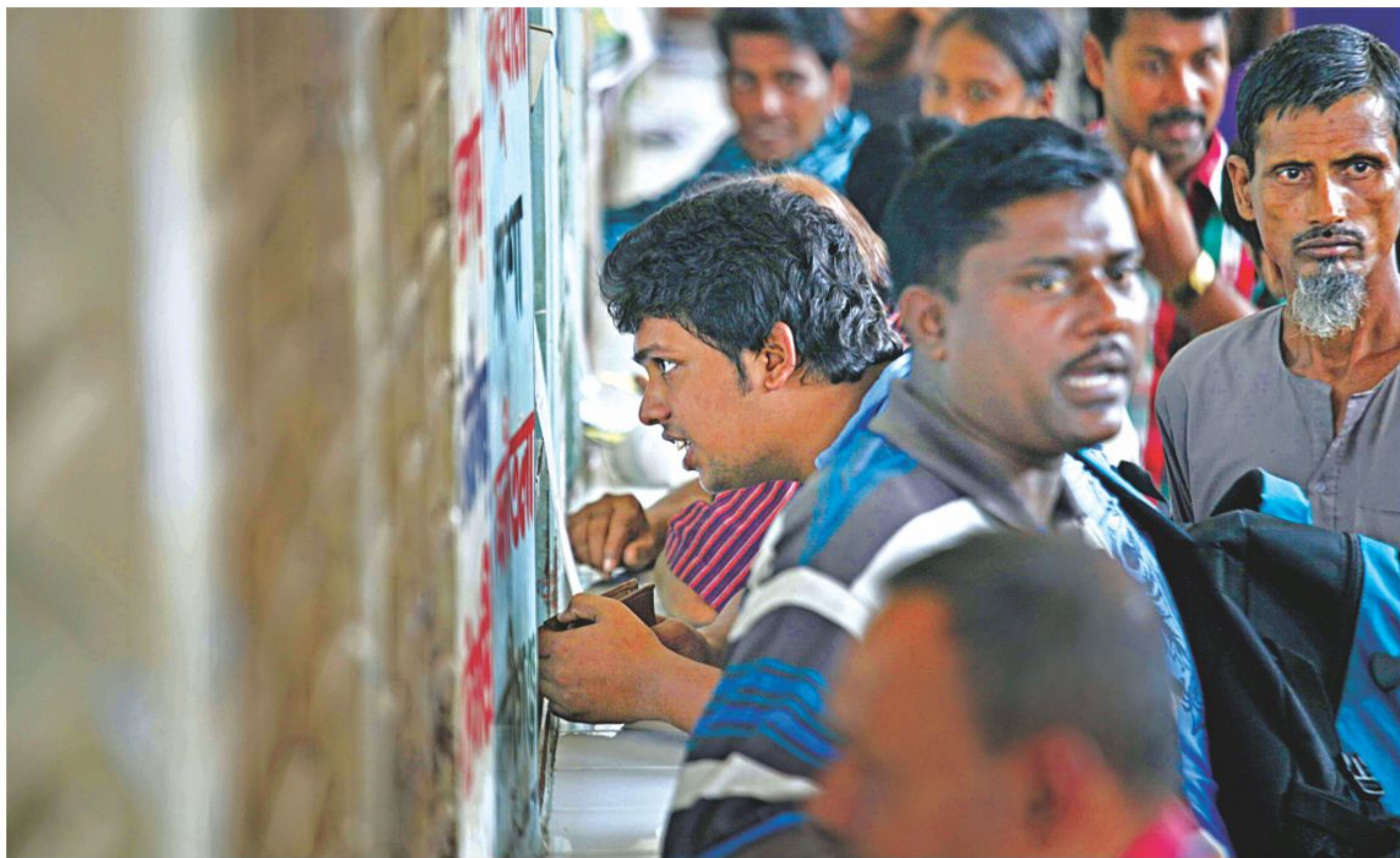
With Eid-ul-Azha a little over a week away, people willing to enjoy the festival outside the capital make queries at the Gabtoli terminal counters about advance bus tickets. The picture was taken yesterday.