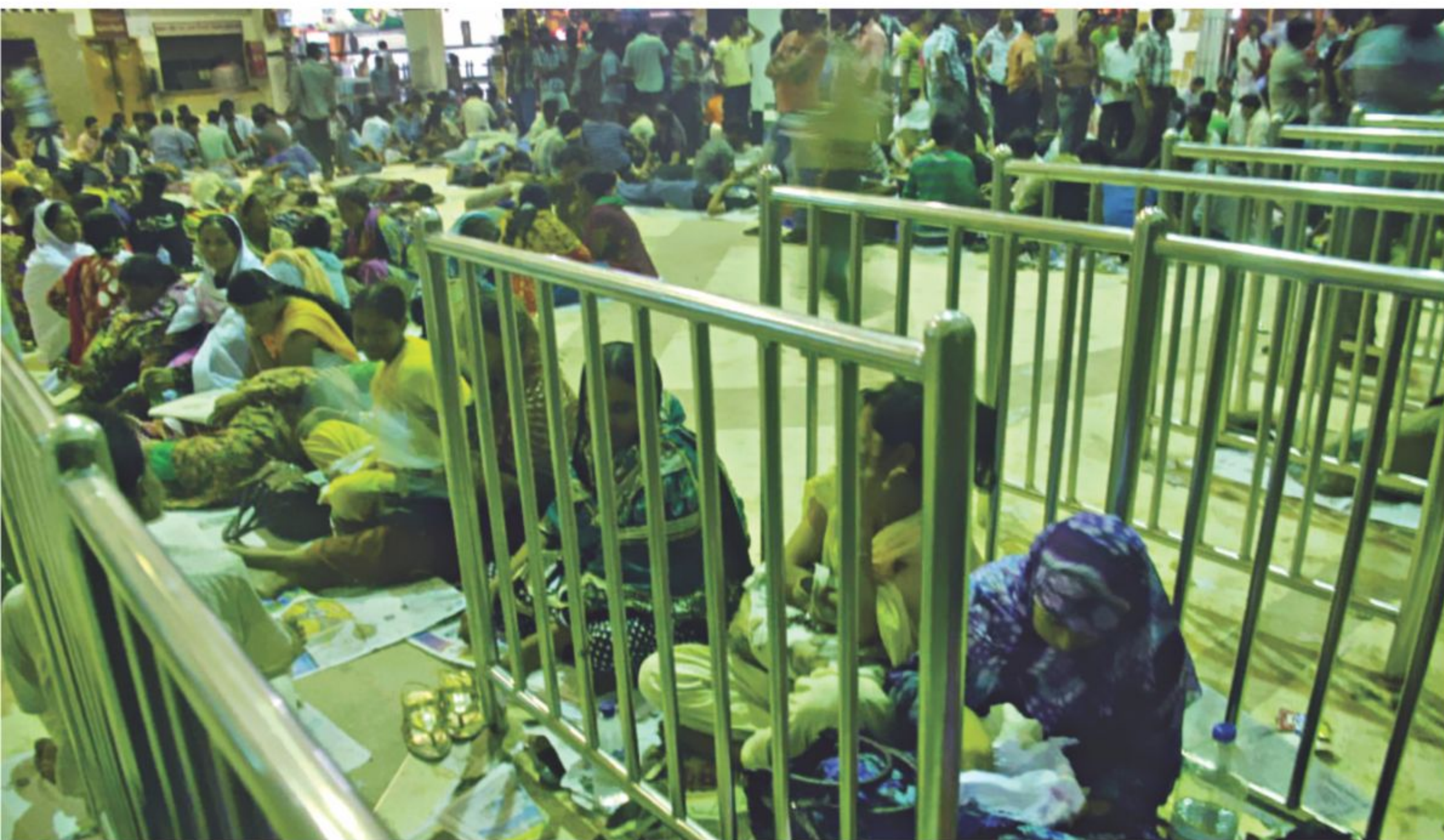
People, wishing to spend their Eid-ul Azha holidays outside the capital, queue up for rail tickets in advance at Kamalapur Railway Station late Monday night, although counters open in the next morning.