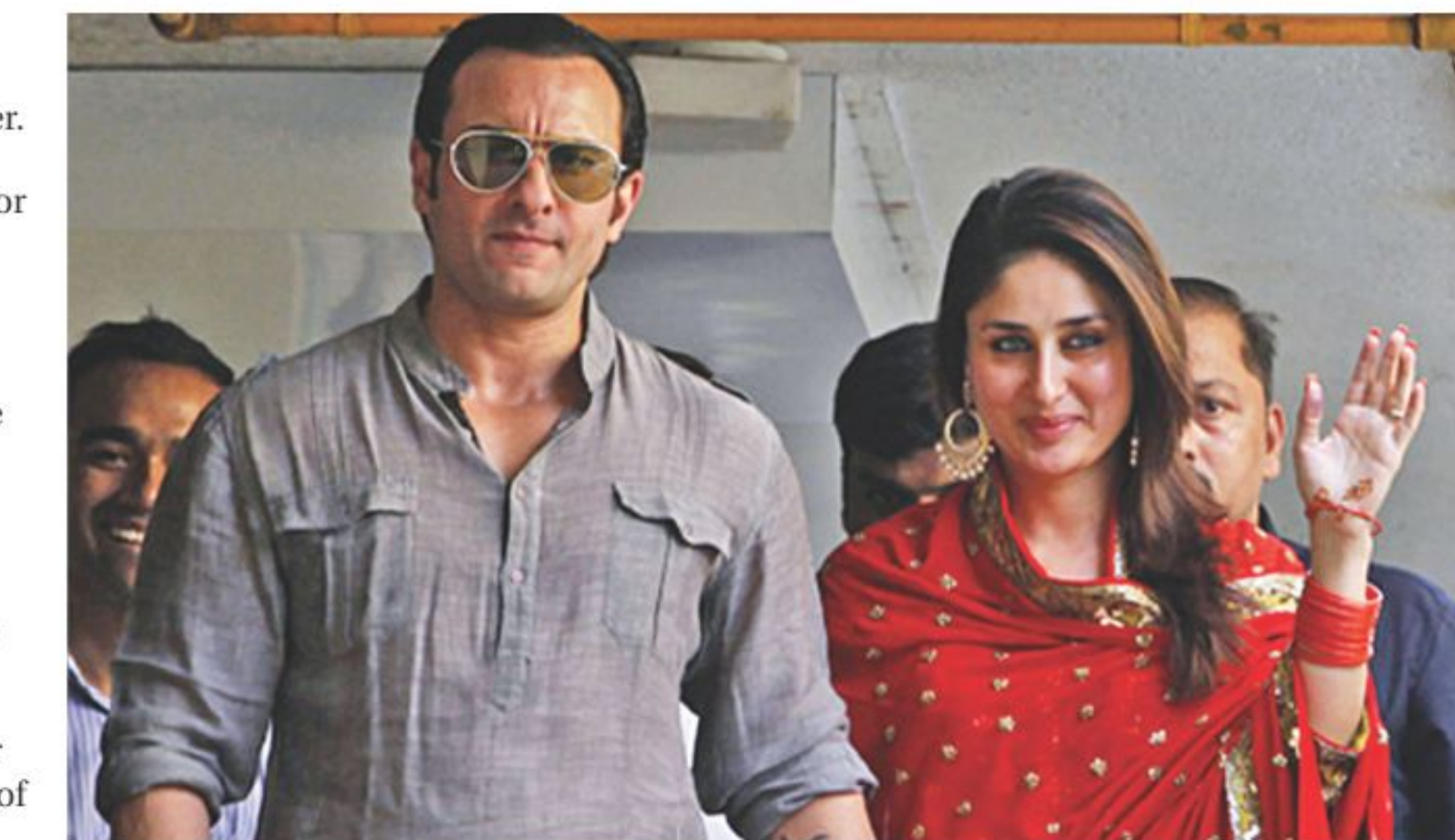
The groom and bride. Saif and Kareena tied the knot in a registered marriage to Amrita Singh, attended the wedding too.