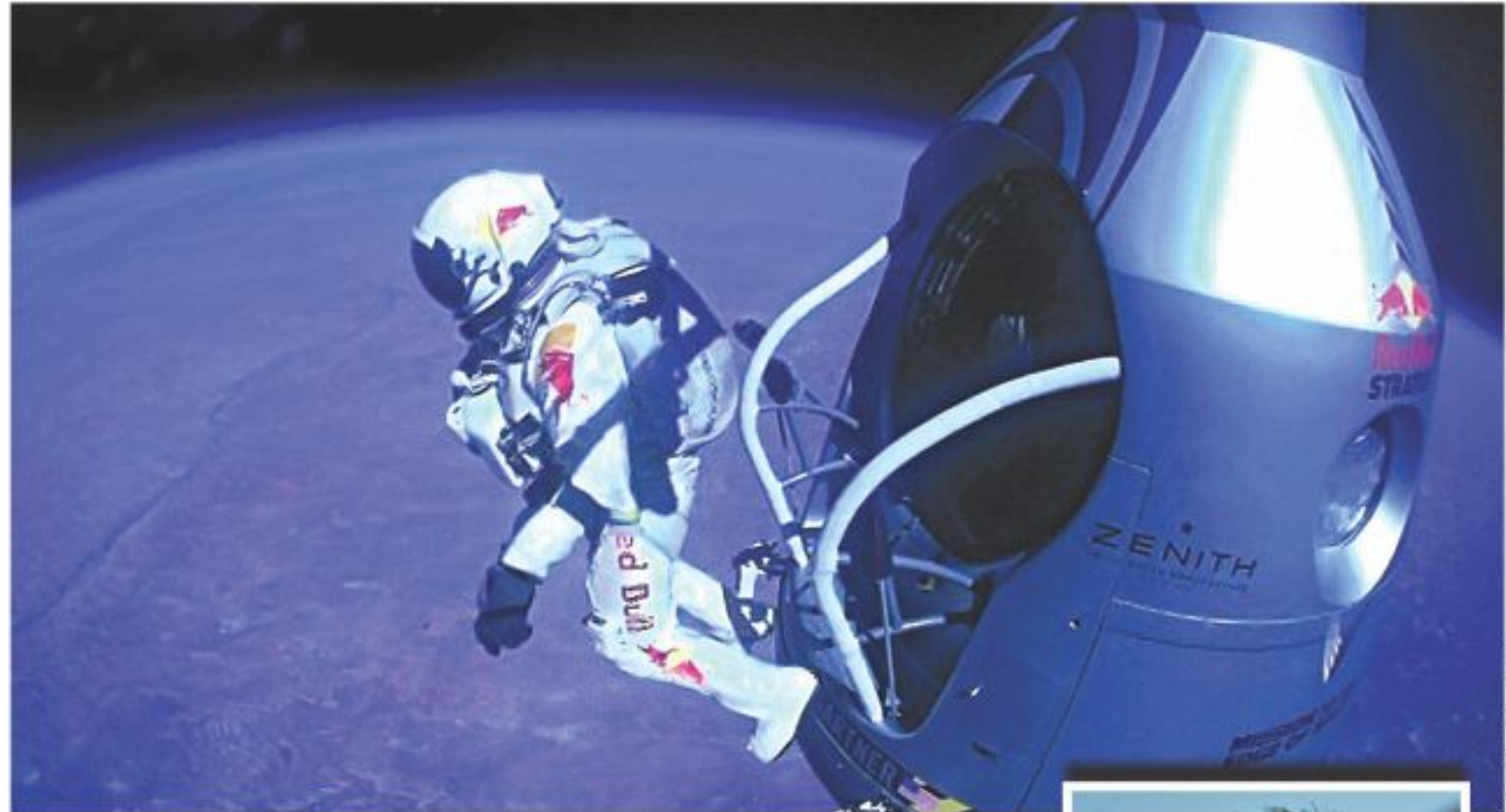
Felix Baumgartner jumping into the unknown from the capsule during the final manned flight for Red Bull Stratos on Sunday.