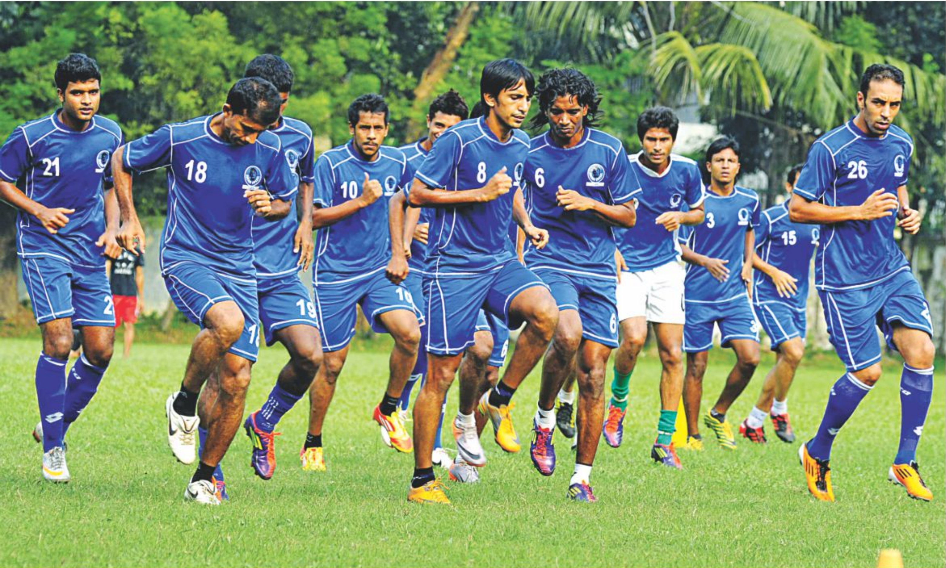
Sheikh Russel players limber up at the BUET ground yesterday, ahead of their Federation Cup quarterfinal clash against Feni Soccer Club at the Bangabandhu National Stadium today.