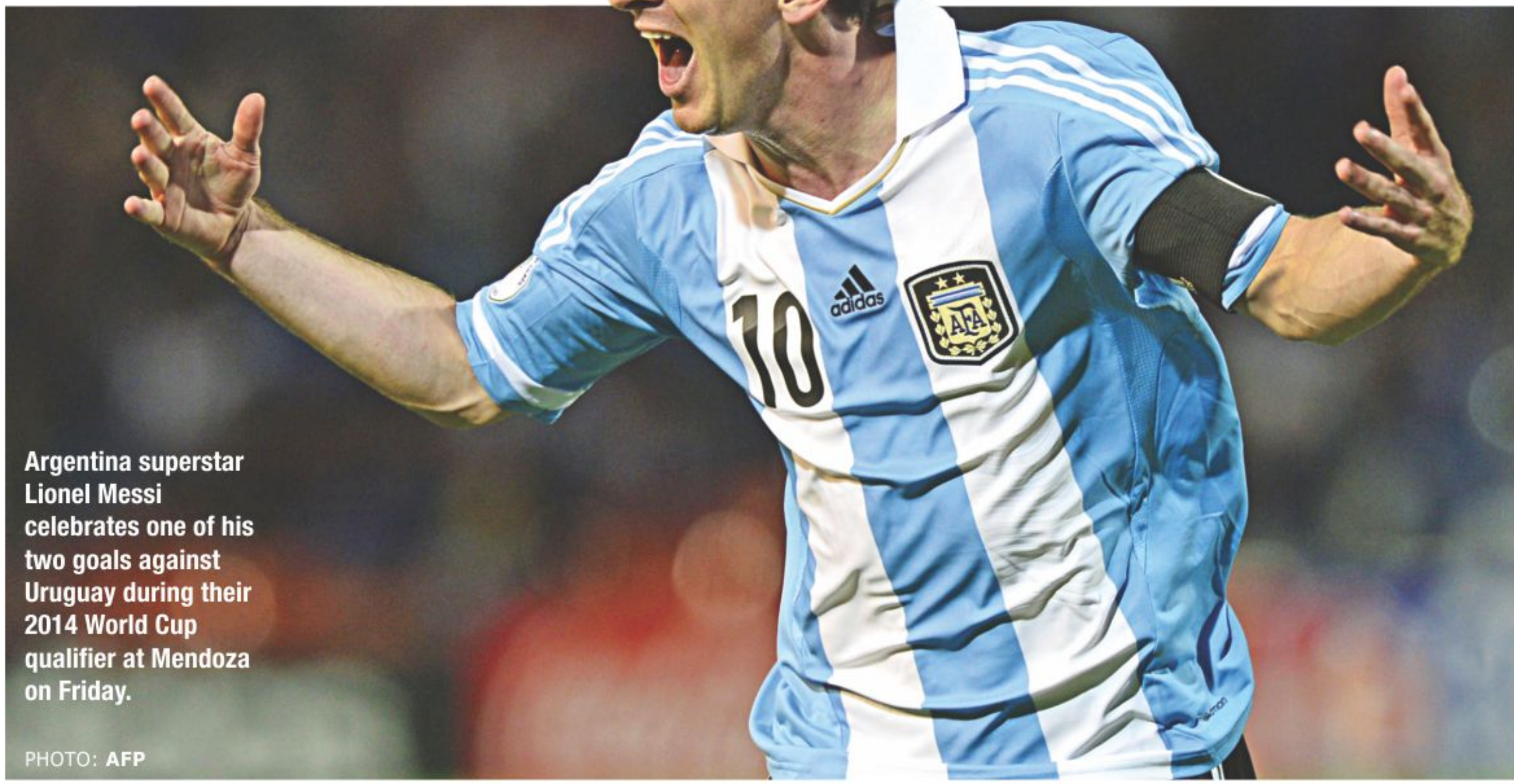
Argentina superstar Lionel Messi celebrates one of his two goals against Uruguay during their 2014 World Cup qualifier at Mendoza on Friday.