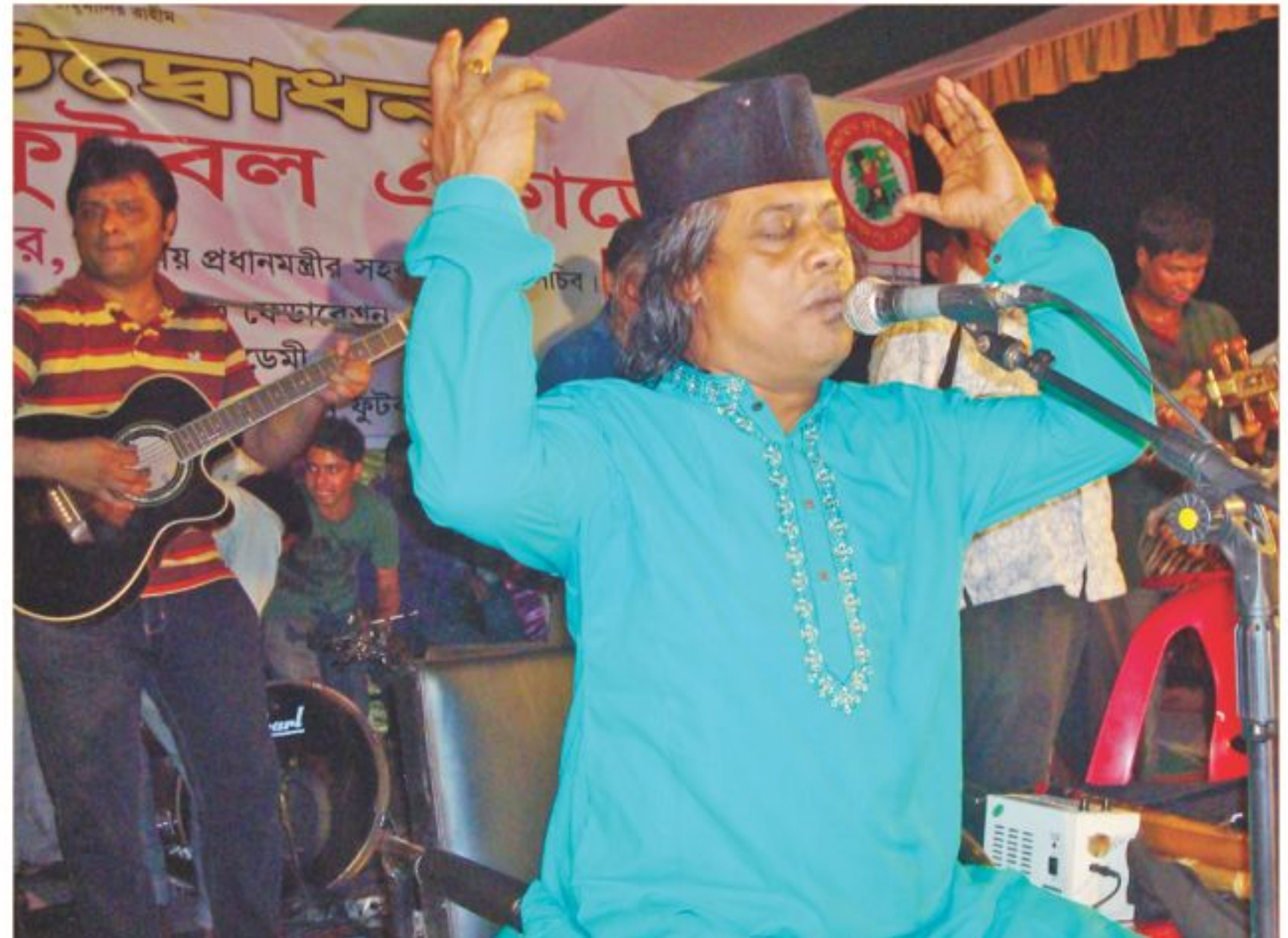
Bari Siddiquee enthralled the audience.