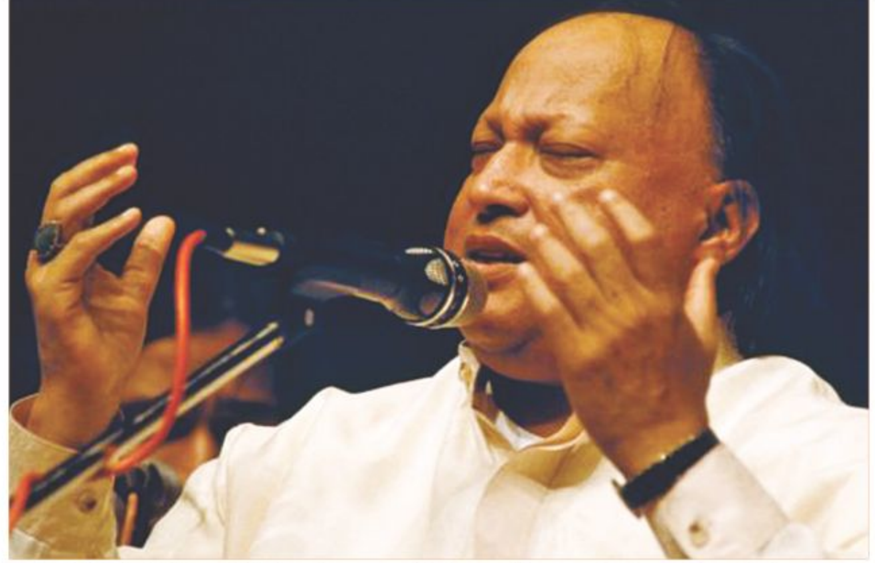
Nusrat Fateh Ali Khan: The iconic qawwali singer who gave Sufi music a whole new meaning.

People often spoke of famous Pakistani singer Nusrat Ali Khan (October 13, 1948-August 16, 1997) in the same breath as iconic reggae artist Bob Marley and even dubbed him the Elvis of the East. There's more. According to the Guinness Book of World Records, Nusrat Fateh Ali Khan holds the world record for the largest recorded output by a Qawwali artiste--a total of 125 albums as of 2001. On his 65th birth anniversary it is opportune to remember the iconic and indefatigable qawwali singer who gave Sufi music a whole new meaning with intense performances that could carry on for several hours. The "Shahenshah-e-Qawwali" was also recognised for taking the international audiences by storm with his introduction of qawwali music