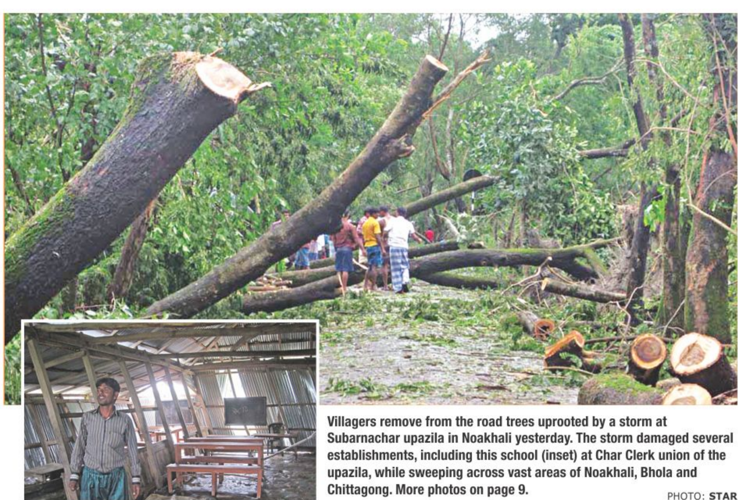
Villagers remove from the road trees uprooted by a storm at Subarnachar upazila in Noakhali yesterday. The storm damaged several establishments, including this school (inset) at Char Clerk union of the upazila, while sweeping across vast areas of Noakhali, Bhola and Chittagong. More photos on page 9.