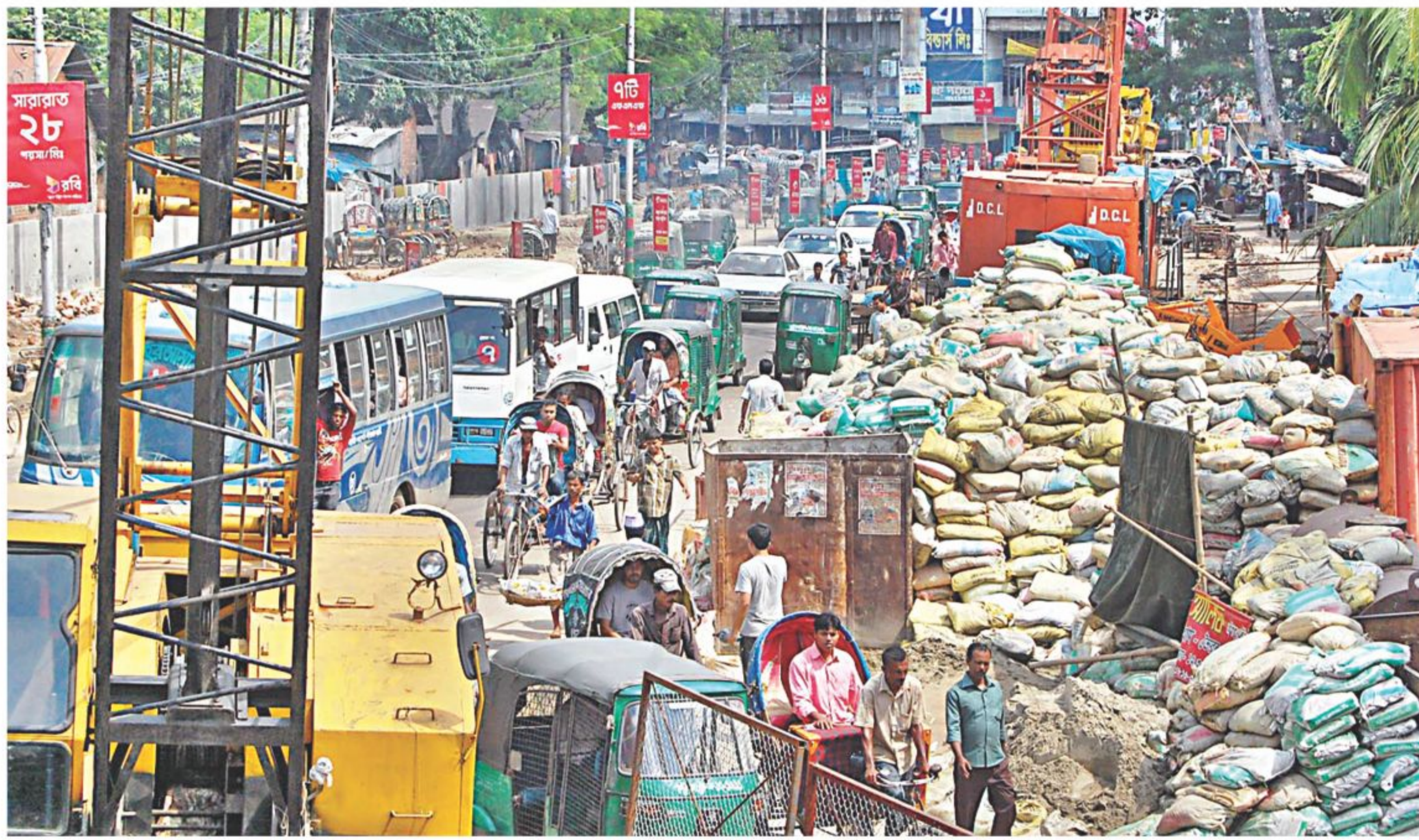
Construction materials of the Kadamtoli flyover in Chittagong city are kept on the pavement and street, disregarding the public suffering it is causing. Day-long traffic congestions have become the norm in the area due to such carelessness.