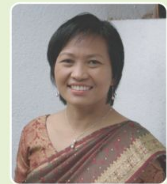
Nigel Chapman CEO Plan International

Today Plan launches a global campaign "Because I am a Girl (BIAAG)" in 68 countries including Bangladesh. The campaign aims to empower millions of girls by helping them acquire education and unleash their strength to change their life and the world around them.