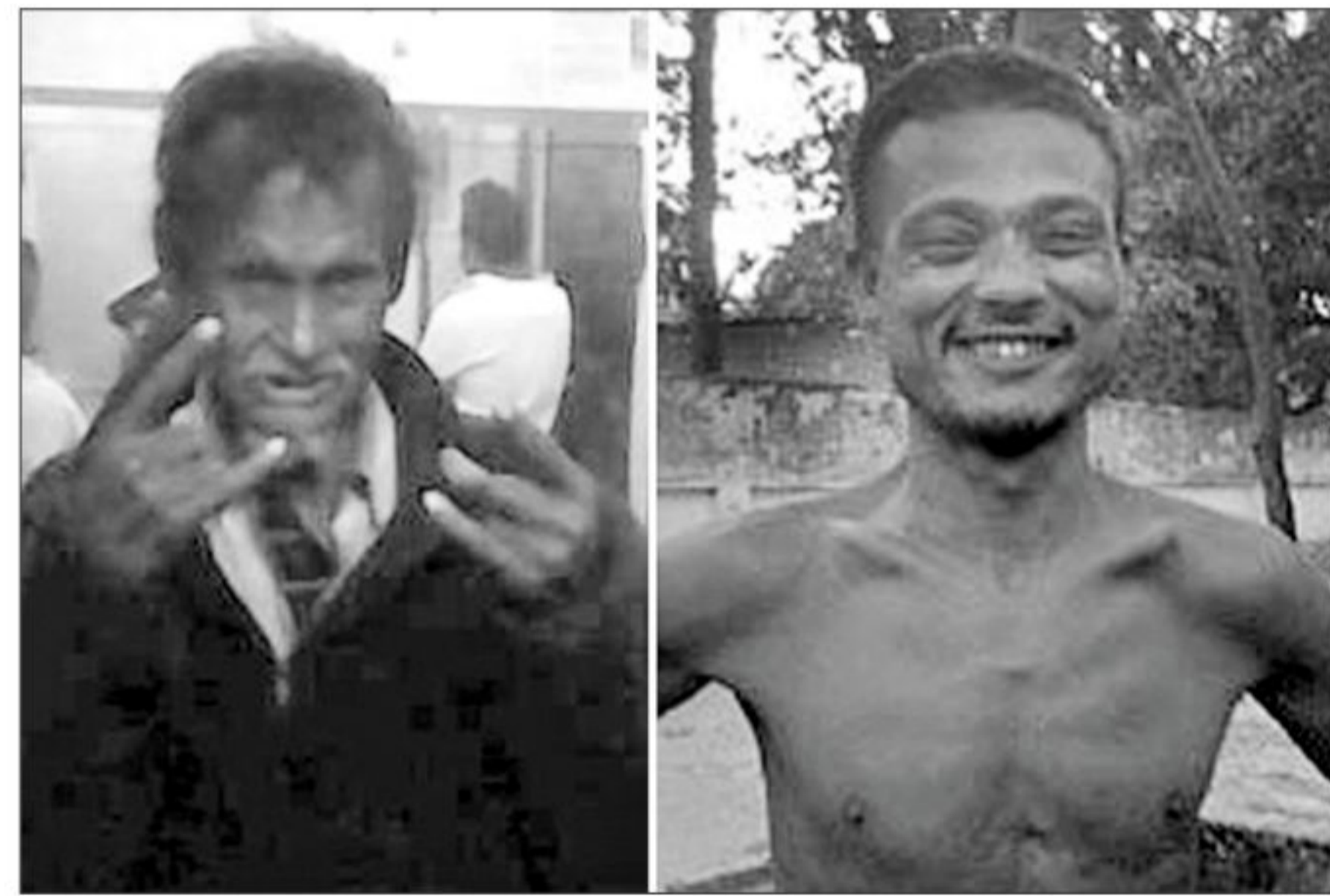
These are some of the mentally sick people often seen moving here and there during the day hours in Magura town. Nobody seems to care where they get their food or stay at night.