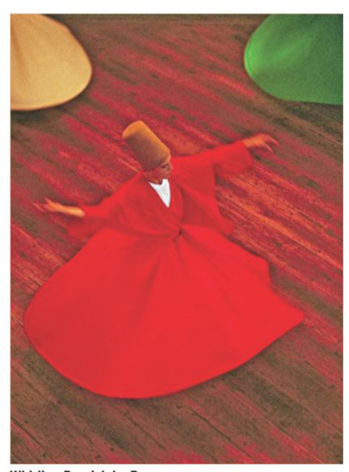
Whirling Dervish by Reza.

Reza Deghati: Well, photography is one of the fastest growing fields of arts, because of the importance of images, especially in the time of internet. You have cell phones with cameras and other low-cost digital cameras to capture images instantly.