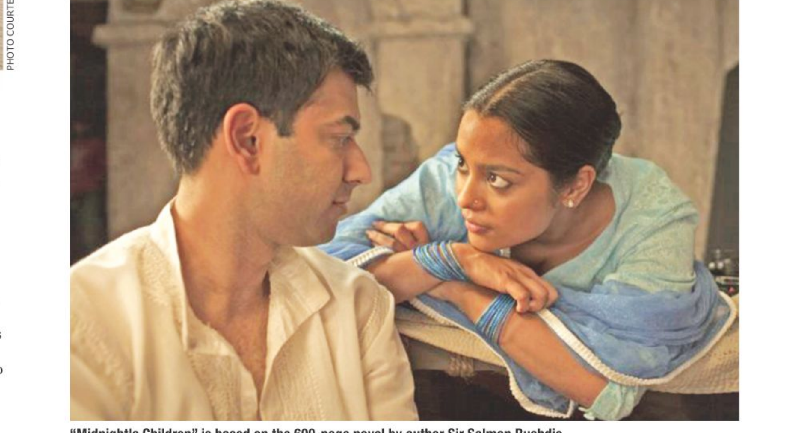
"Midnight's Children" is based on the 600-page novel by author Sir Salman Rushdie.