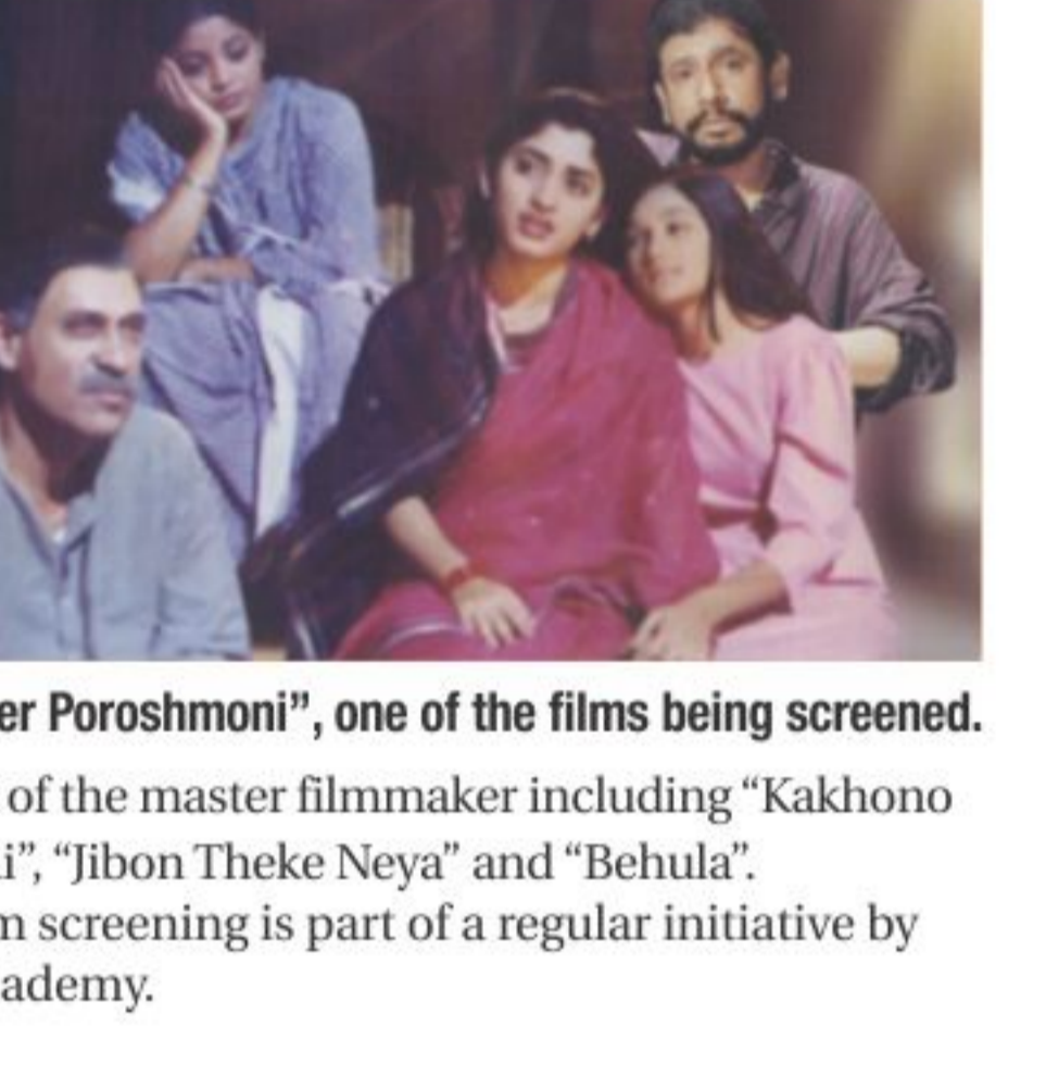
"Aguner Poroshmoni", one of the films being screened.

STAFF CORRESPONDENT A three-day screening of Humayun Ahmed films began yesterday at the National Music and Dance Centre Auditorium of Bangladesh Shilpakala Academy, Dhaka.