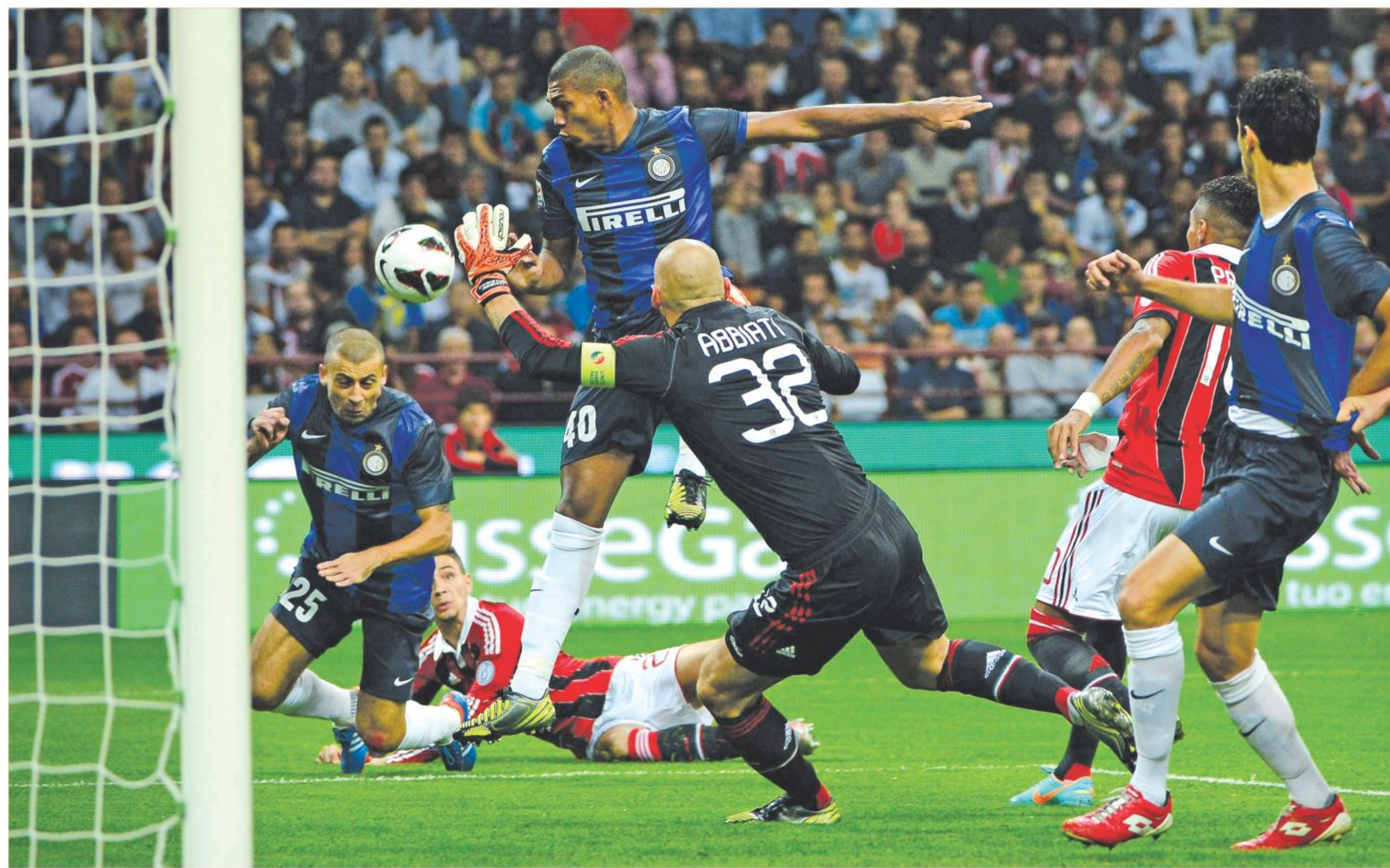
Inter Milan defender Walter Samuel (L) scores the all-important goal of the Milan derby during their Serie A encounter against Milan at San Siro on Sunday

Zenit Saint Petersburg defender Domenico Criscito returns only months after pulling out of the Euro 2012 squad after his name cropped up in a match-fixing scandal, in which he was later cleared.