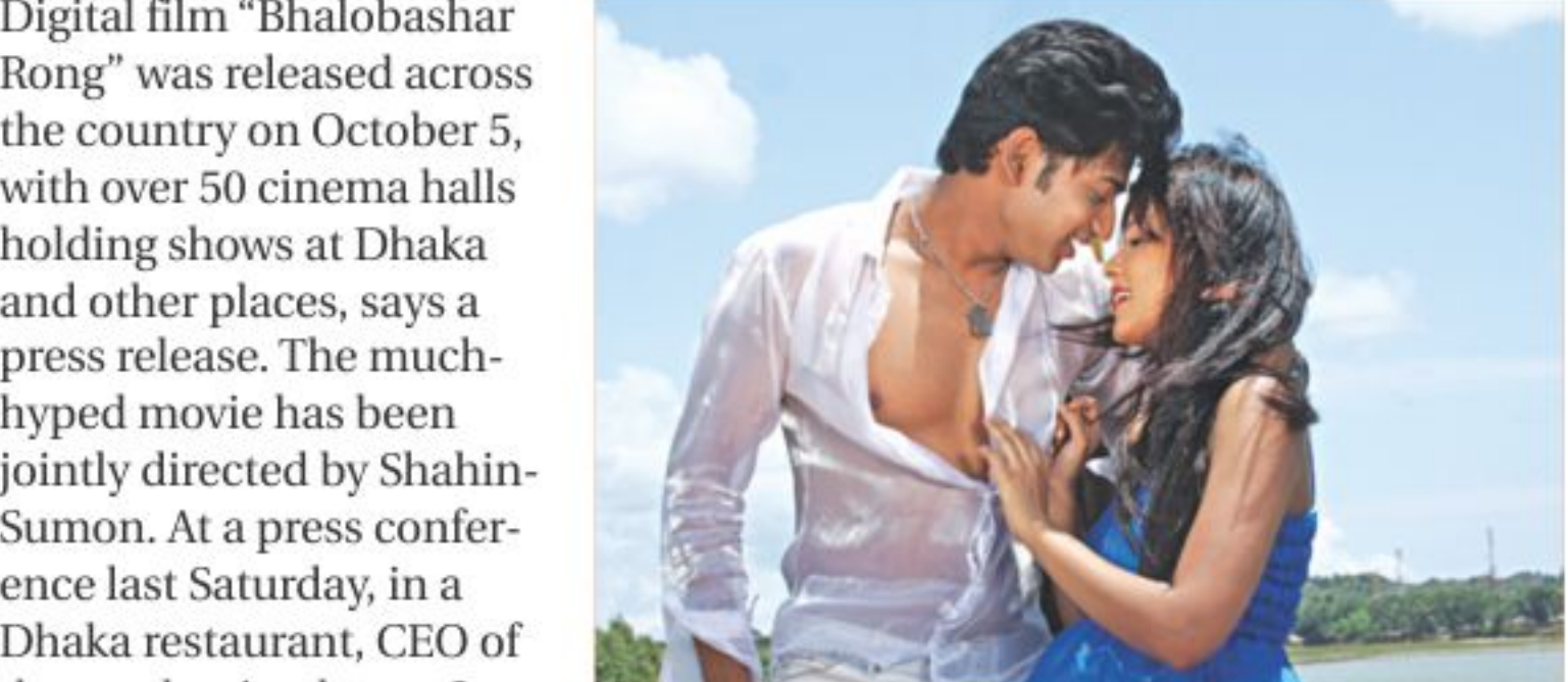
A scene from the film.