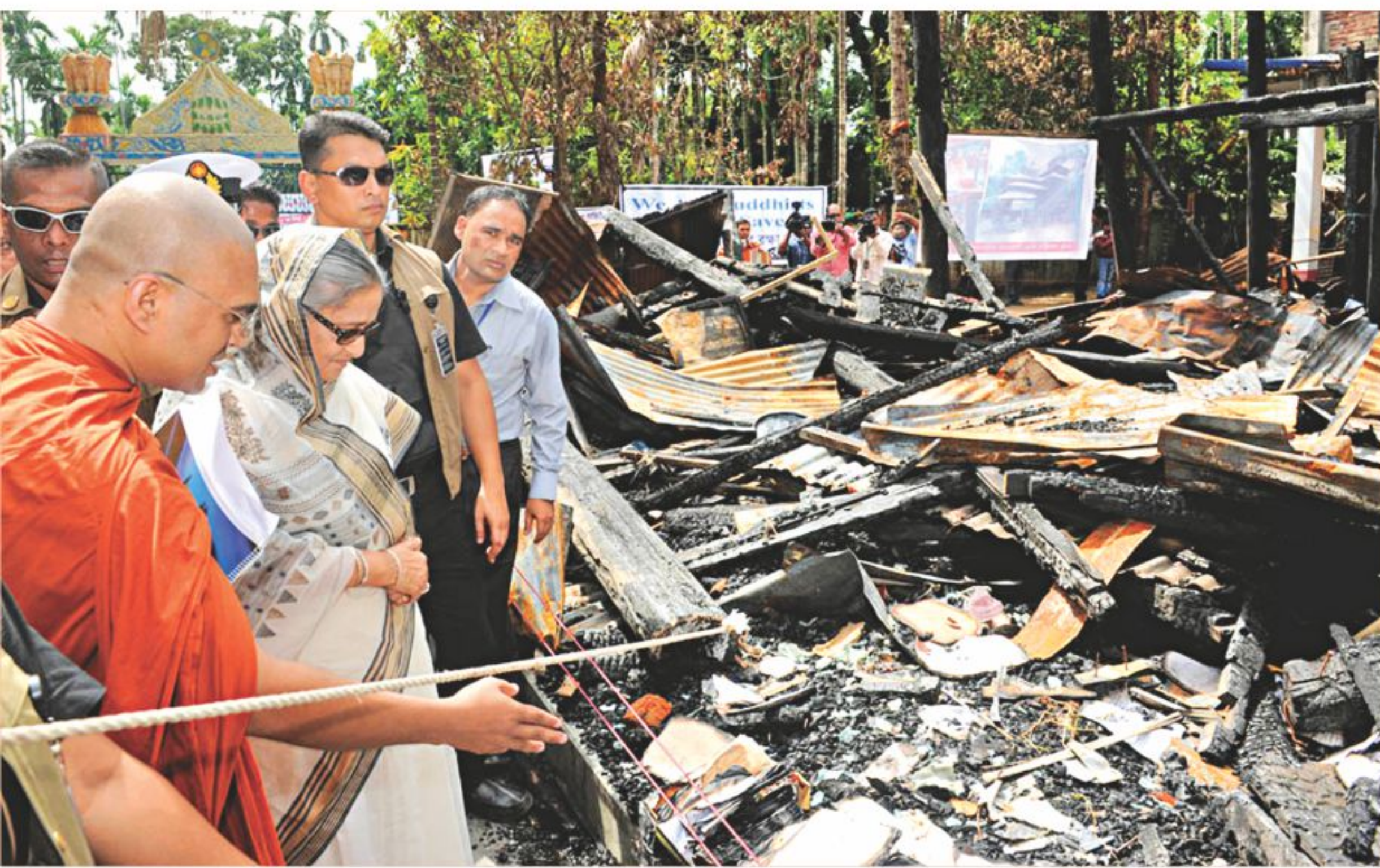
Prime Minister Sheikh Hasina in Ramu yesterday visits the ruins of Buddhist temples and houses destroyed in last week's mayhem launched by Muslim fanatics.