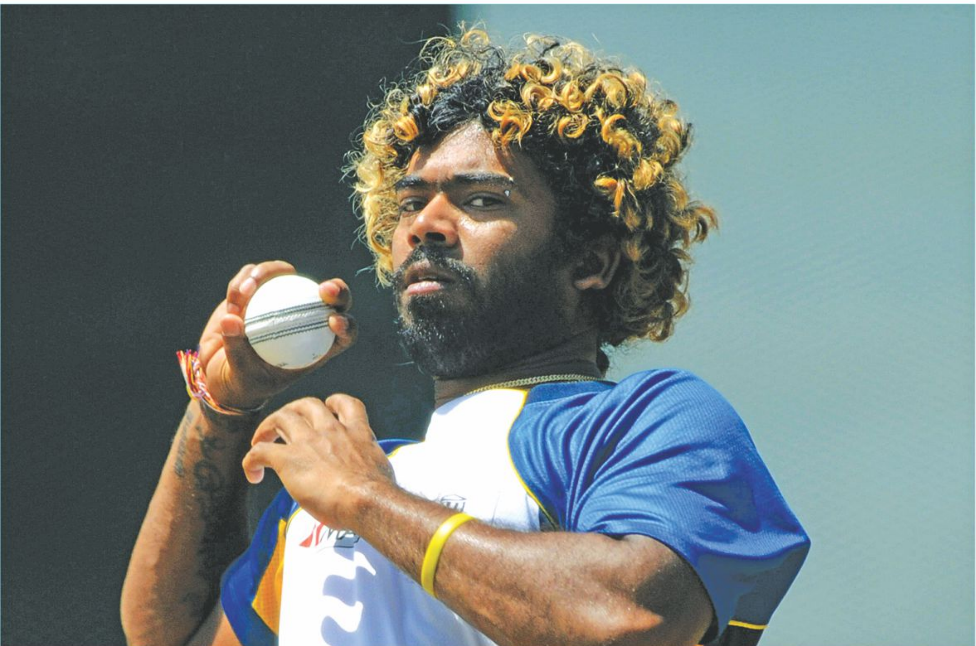
Sri Lanka will seek an early thrust from their paceman Lasith Malinga to win the mouth-watering ICC World T20 final against the West Indies at the R Premadasa Stadium in Colombo today.

"The physio did not tell me anything very serious (about the injury that Gayle suffered