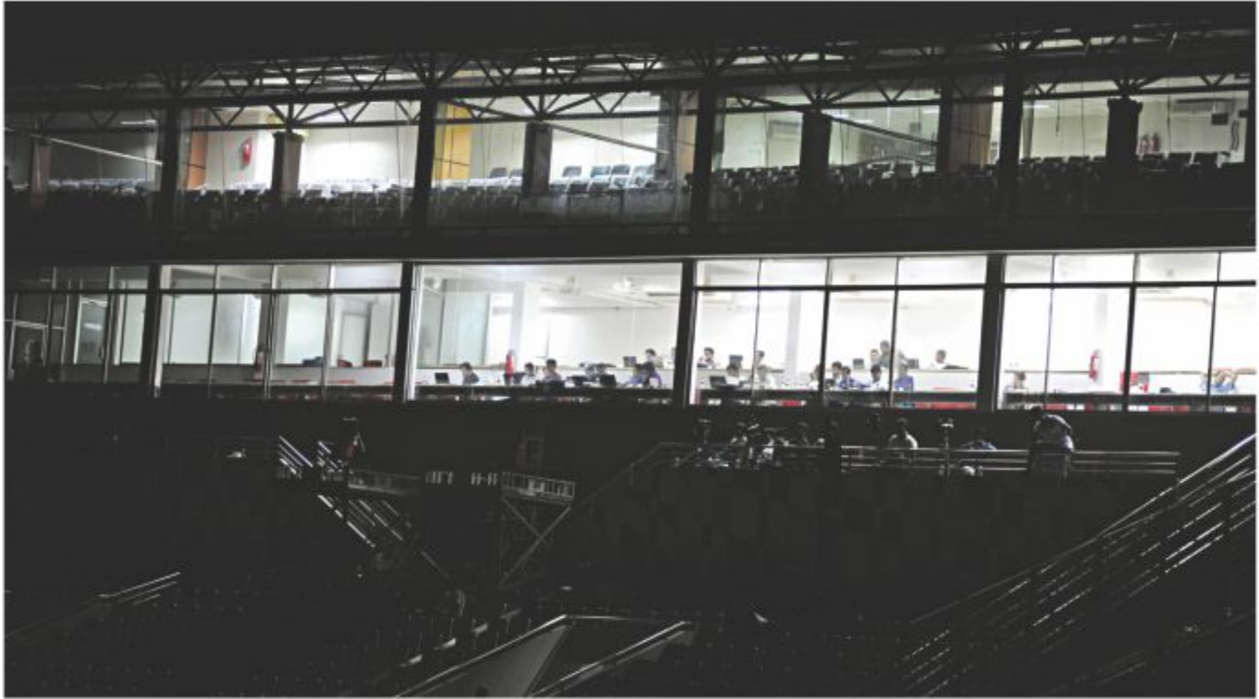
Total darkness grips the Bangabandhu National Stadium yesterday that eventually forced the cancellation of the Federation Cup football's second match between Muktijoddha Sangsad and Noakhali Football Academy.