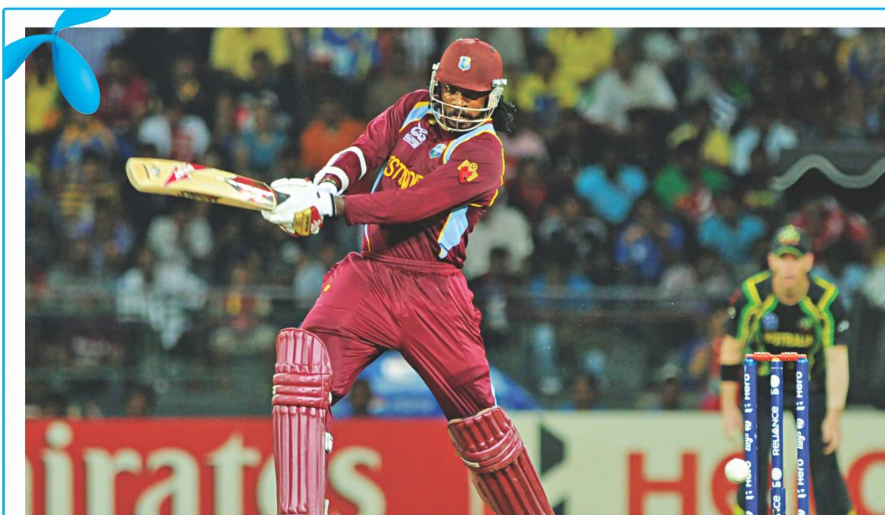
West Indies superstar Chris Gayle plays a cover drive on his way to scoring an unbeaten 75 during the World Twenty20 semifinal against Australia at the R Premadasa International Cricket Stadium in Colombo yesterday.